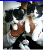
Paris and Pax