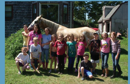
AIR GUARD CAMP July 28 - Aug. 1 from 9:00 a.m. to 3:00 p.m.