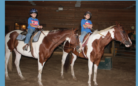
STARS, STRIPES & SADDLES CAMP July 14 -18 from 9:00 a.m. to 3:00 p.m.