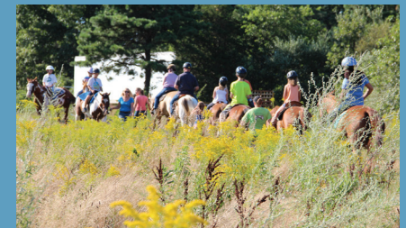
FAMILIES IN TRANSITION CAMP August 11 - 15 from 3:00 to 7:00 p.m.

All camps will be held at: SMITHFIELD FARM 809 SANDWICH RD. EAST FALMOUTH, MA 02536