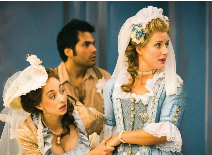
Opera Lafayette