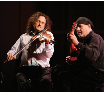
Martin Hayes and Dennis Cahill