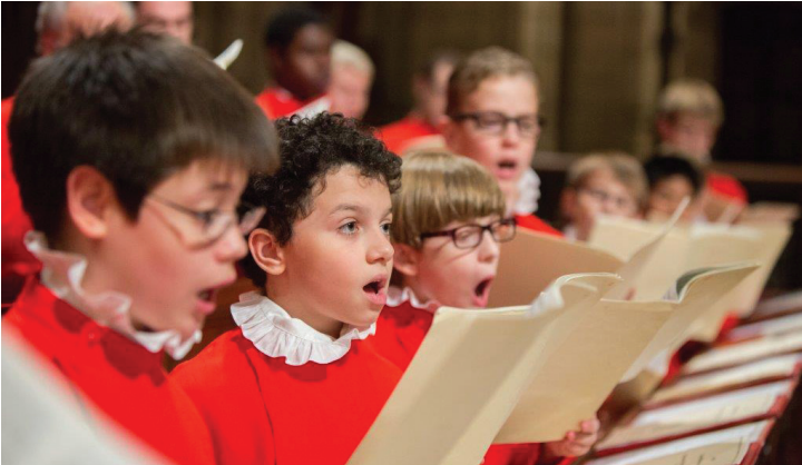
The Treble Choristers of the Saint Thomas Choir of Men and Boys

“Bringing little-known 18th-century French opera to the Opéra Royal at...Versailles takes audacity and confidence...Opera Lafayette, based in Washington, has done it twice.” —INTERNATIONAL NY TIMES