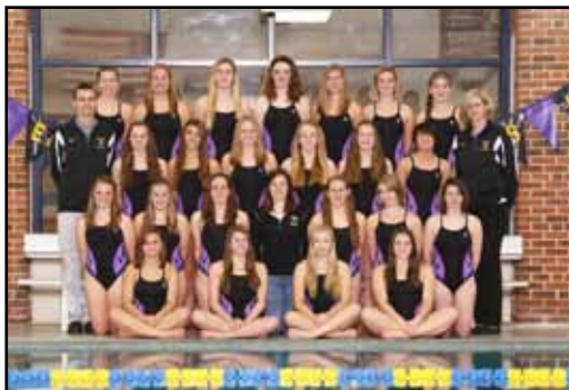
2013 Girls Swim Team - WIAA Division 2 State Runner-up