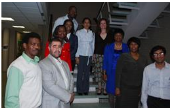
MAN Digital Scholars

The MAN Digital Scholars (DS) Program is a vibrant community of faculty and graduate students with common action research interests in multicultural research in the field of adoption and integration of Multimedia Educational Resources for Learning and Online Teaching (MERLOT). The MAN DSs serve as mentors, innovators, project leaders, and liaisons communicating the interests and innovations of educators in the area of education technology to the larger MAN community. MAN Digital Scholars will be faculty and graduate student with discipline expertise in education and health for development. Digital Scholars are expected to implicate Undergraduate Students in their respective institutions.