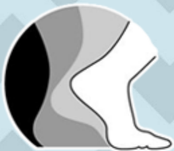
Kansas City Foot Specialists, P.A.