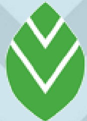
VALLEY VIEW BANK