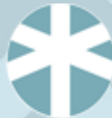
HILLCREST COVENANT CHURCH