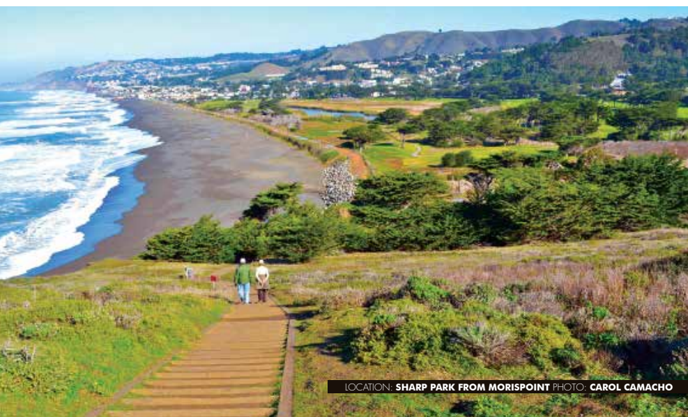
LOCATION: SHARP PARK FROM MORISPOINT

trails overlooking the ocean, especially the ascent up the sides of Montara Mountain to 2,000 feet above town. We've done numerous hikes in the town and strongly recommend the quite easy Mori Point coastal walk. We loved the more strenuous trek on the trail up to Sweeney Ridge for stunning panoramic vistas. But keep in mind, there are many more hiking trails, and the locals, hotel employees or the Visitor Center will fill you in on others. And all those wonderful beaches mentioned earlier provide romantic surfside sandy beach strolls.