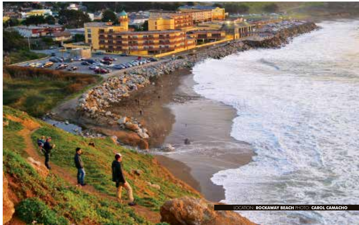
LOCATION: ROCKAWAY BEACH