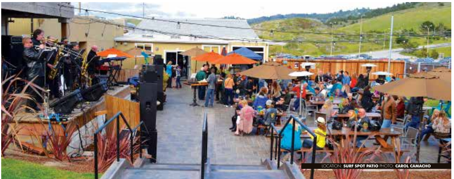
LOCATION: SURF SPOT PATIO

We've experienced a number of Pacifica's restaurants, and after a day of strenuous outdoor adventures, dining out is a definite must. Here are a few of our favorites: Puerto 27, located in the Pacifica Beach Hotel, is a relative new star on the local culinary scene featuring cuisine from Peru. It's very rare to find a Peruvian restaurant in Northern California, and the experience was exceptional. Be sure to try a Peruvian