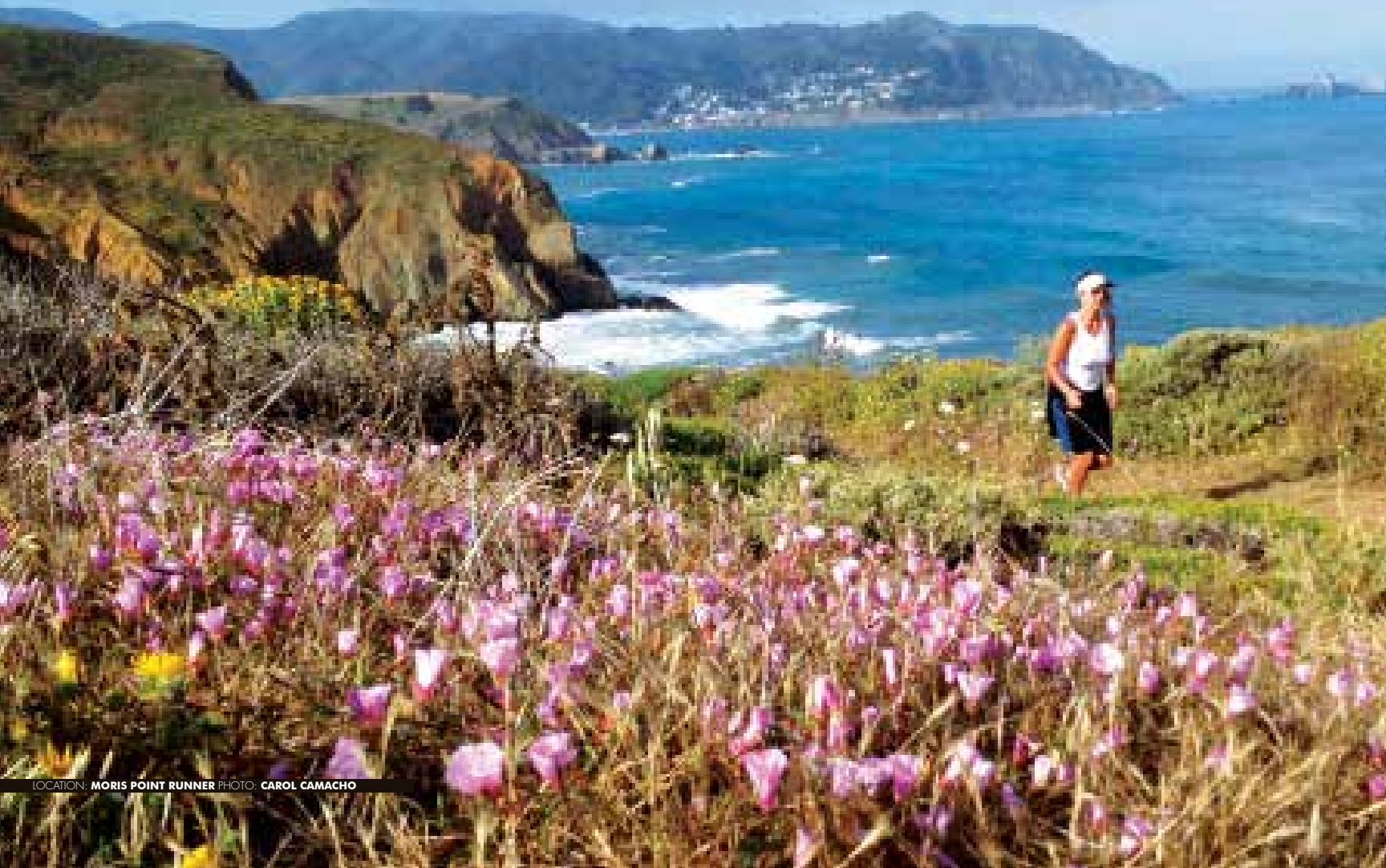
LOCATION: MORIS POINT RUNNER