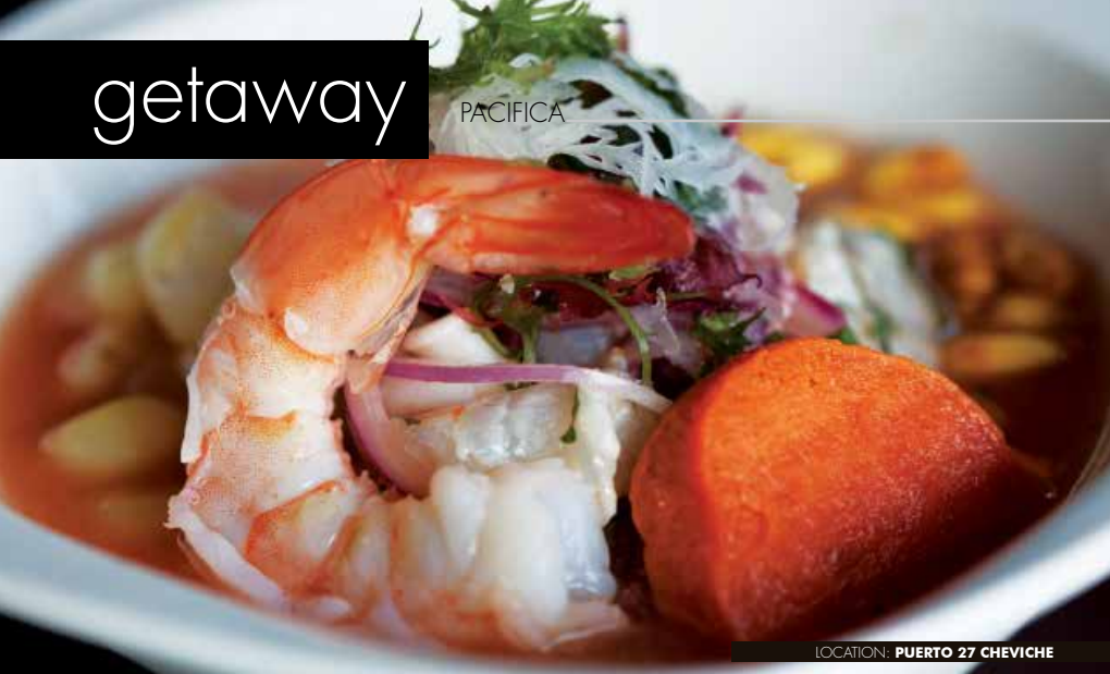
LOCATION: PUERTO 27 CHEVICHE