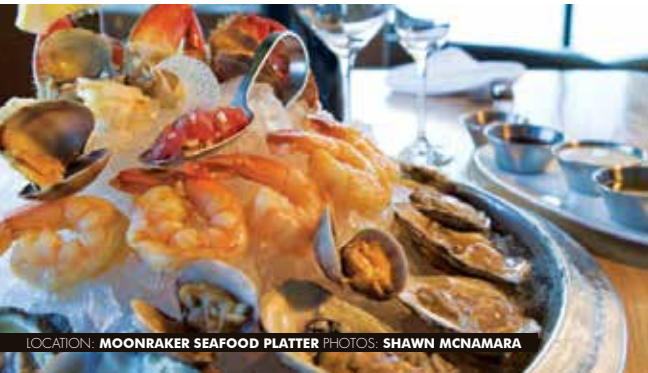
LOCATION: MOONRAKER SEAFOOD PLATTER