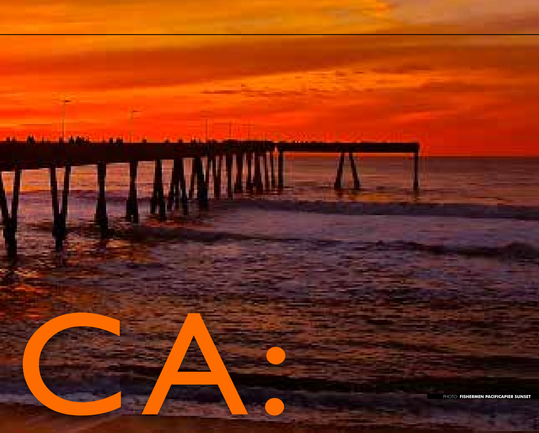
PHOTO: FISHERMEN PACIFICAPIER SUNSET