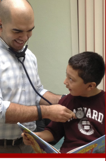
American Indians have significant health disparities that impact the quality and longevity of life.