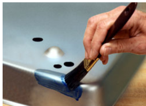
Blue Stop-Off brushed onto surface part