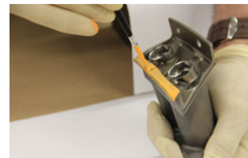
Orange Stop-Off brushed on vane segment