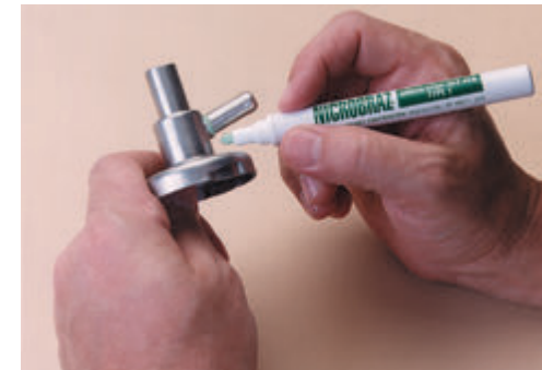
Green Stop-Off pen in use

Surface-active materials that prevent high temperature molten filler metal from bonding to a protected surface, either by penetration or, by flowing under the Stop-Off.