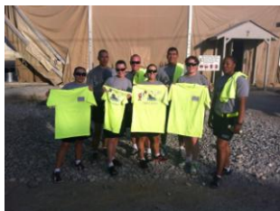
Dog Days of Summer Run

This past month the Soldiers past the time by participating in several MWR events to include the Dog Days of Summer 5K sponsored by the local Vetrinarian Detachment and the 9/11 Memorial Run sponsered by BAF MWR. In addition the Soldiers have been conducting physical training three days a week, but took a well deserved break from running, weight lifting, and calesthinics on Friday the 13 th to play volleyball.