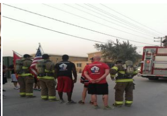
9/11 Moment of Silence