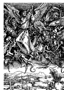
Exultation of Michael and the Dragon by Albrecht Dürer

THE CHRISTIAN COMMUNITY MOVEMENT FOR RELIGIOUS RENEWAL