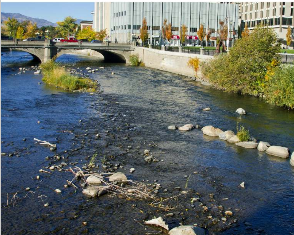
Truckee River Island Park circa 1937 and 2013.