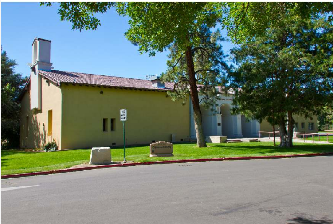
California Building at Idlewild Park circa 1928 and 2013.