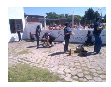
This is how it looks now © © ©