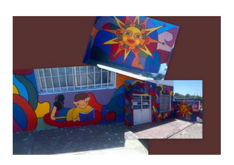
Many thanks and God bless on behalf of all of us at CAIF Creciendo ....