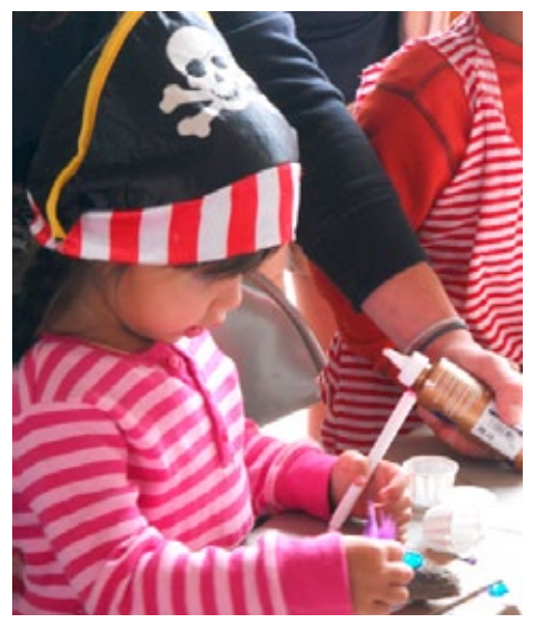
One of last year's little "buccaneers" being creative at the Harbor's Pirate Days.

WORKERS ON SATURDAY OR SUNDAY: If you can spend some time either of these days working with kids who love to do art, please email kitty@buenaventuragallery.org.