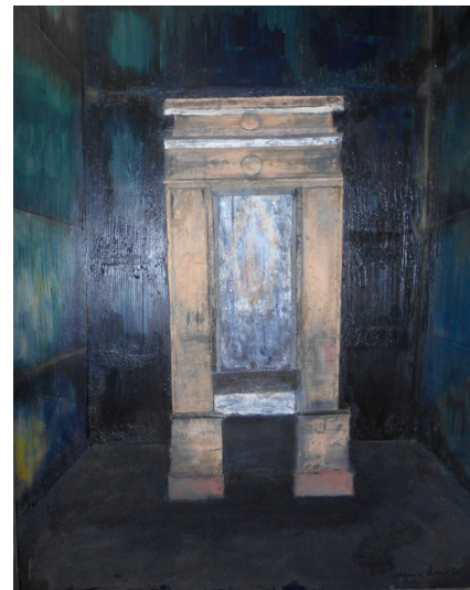
First Place Entry by Virginia Buckle in the 2014 Collage & Mixed Media Open Competition (left).