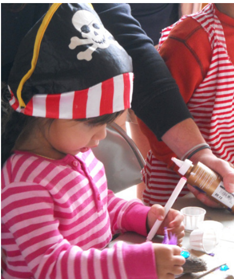
One of last year's little "buccaneers" being creative at the Harbor's Pirate Days.

WORKERS ON SATURDAY OR SUNDAY: If you can spend some time either of these days working with kids who love to do art, please email kitty@buenaventuragallery.org .