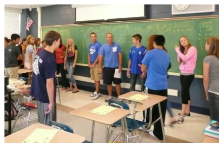
Conflict Resolution Skills Peer Training

We are proud of the proactive steps we take in regard to this issue. First, we set clear behavioral expectations for living up to the Character Counts! ethical values of Respect, Responsibility, Fairness, Caring, and Citizenship. Then we encourage all members of the school community, including students, parents, volunteers, and visitors, to report alleged acts of bullying, intimidation, harassment, and other acts of actual or threatened violence via our on-line, anonymous "Report Bullying" site. Furthermore, we provide a nationally renowned anti-bullying and internet safety expert to speak to sophomores in the fall, and we present curriculum to freshmen in the spring. Additionally, we teach conflict resolution and negotiation skills to our