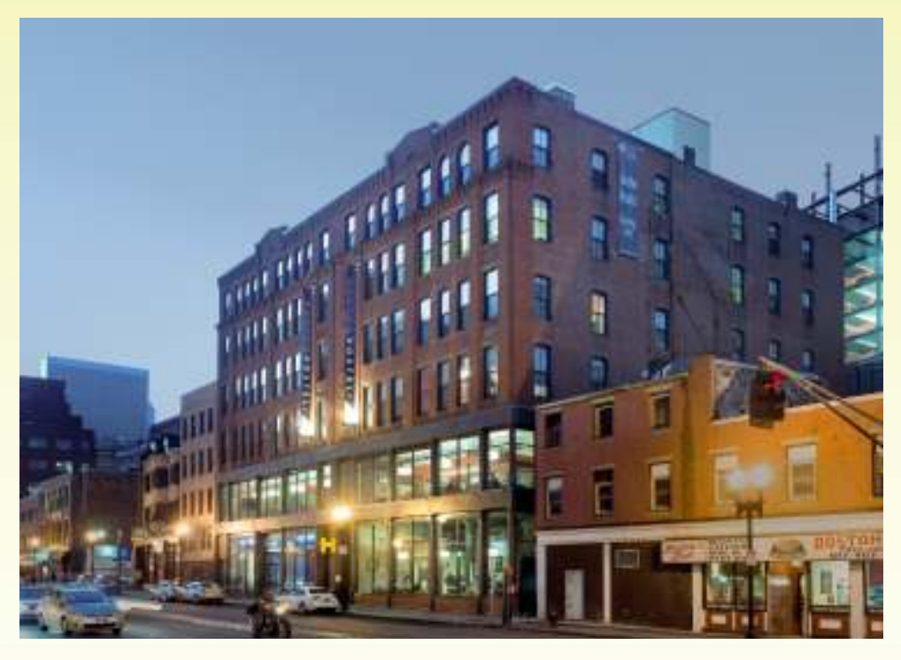
Boston Green Tourism Meeting Thursday, May 1, 2014