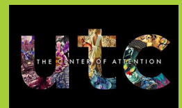
$250 UTC Gift Card