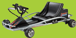
Electric Go Kart