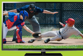
Flat Screen TV