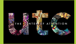
$100 UTC Gift Card