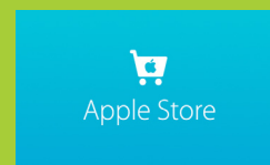
$250 Apple Gift Card