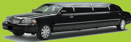
Limo & Lunch for You and 5 Friends