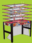
10 in 1 Game Table