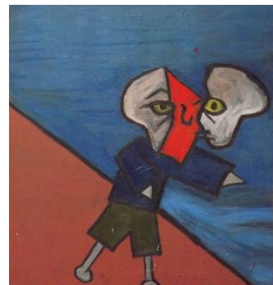
Scott Cowgill, "Untitled 10"