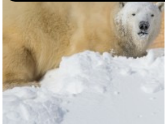
Hudson the polar bear