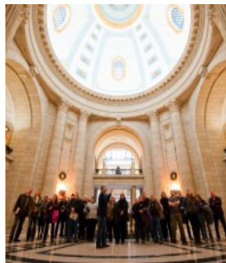
Hermetic Code Tour