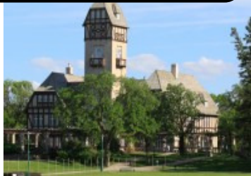
Assiniboine Park Pavillion