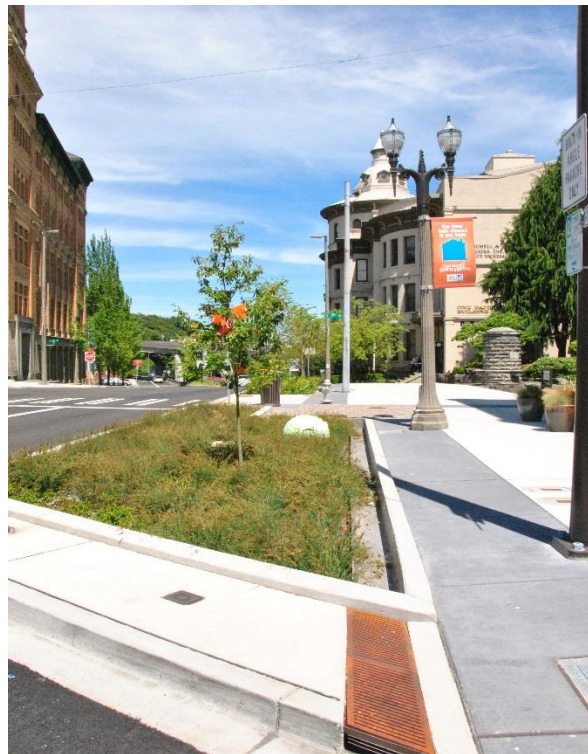
Pacific Ave Rain Gardens ~ Tacoma, WA