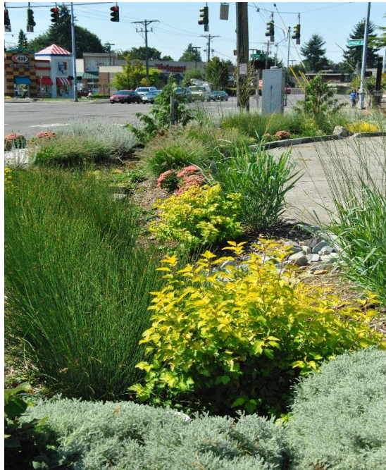
6 th Ave Rain Garden ~ Tacoma, WA