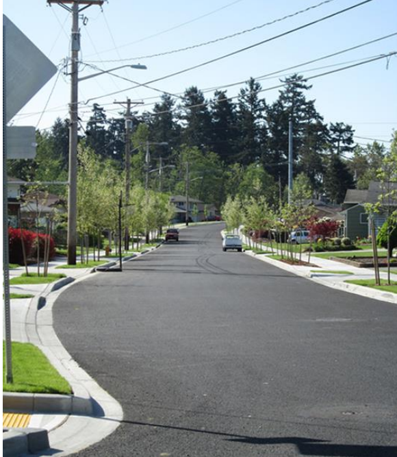
Wapato Lake Drive ~ Tacoma, WA