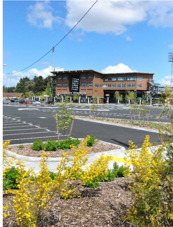
Cheney Stadium ~ Tacoma, WA