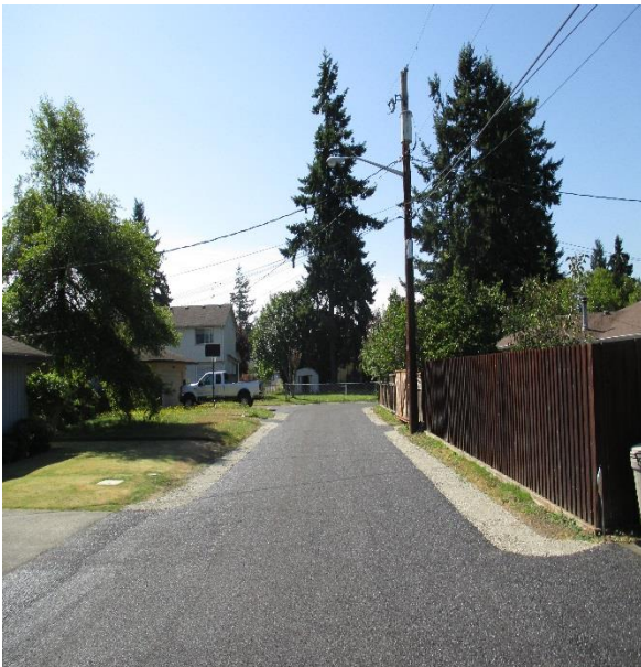
Porous Alley/ Wilson Av. ~ Puyallup, WA