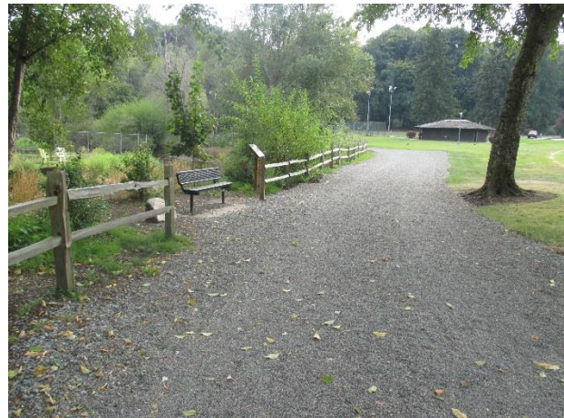
Porous Maintenance Road ~ Puyallup, WA