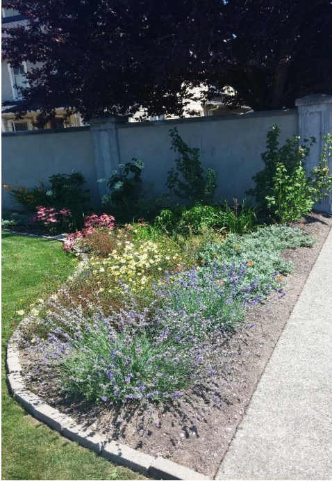
Rain Garden ~ Puyallup, WA