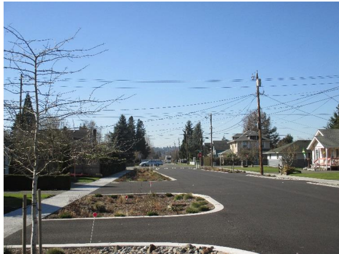
8 th Av. Retrofit ~ Puyallup, WA