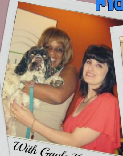
With Gayle King on Oprah Radio