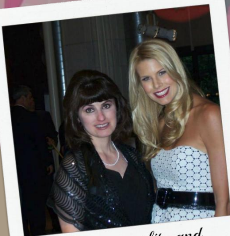
With tv personality and animal advocate, Beth Stern