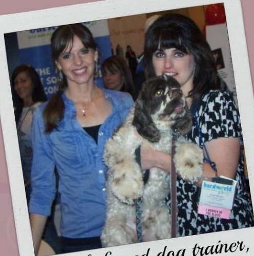
With famed dog trainer, Victoria Stilwell