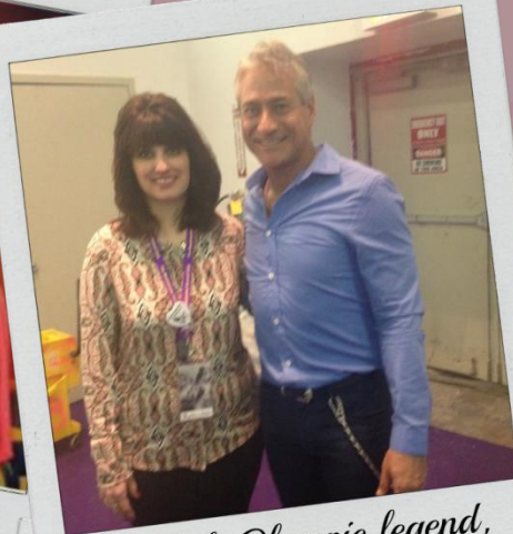
With Olympic legend, Greg Louganis