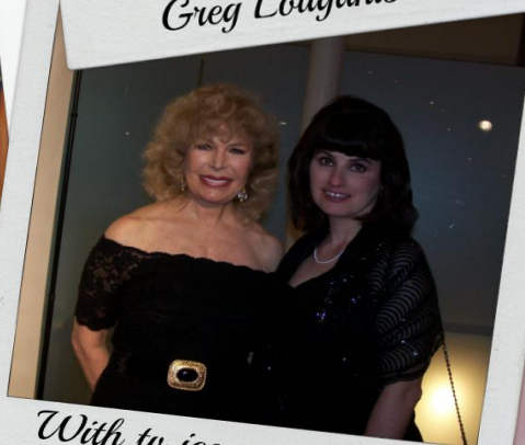
With tv icon and animal lover, Loretta Swit