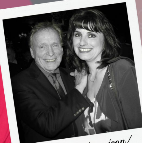
With American icon/ tv legend, Dick Cavett