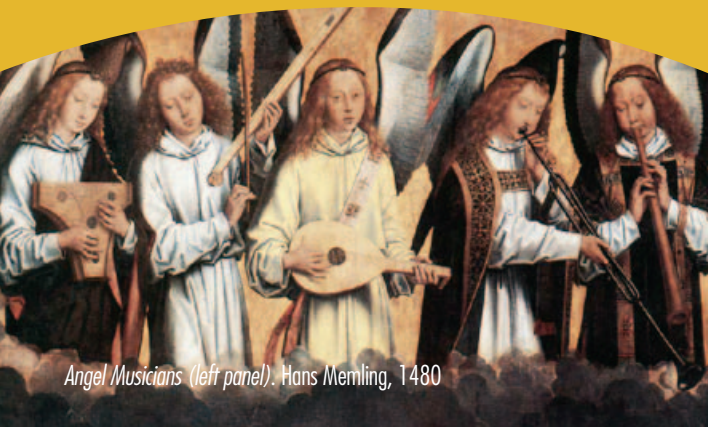
Angel Musicians (left panel). Hans Memling, 1480