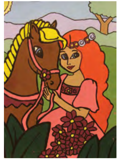
Shruti Sakar, Age 8 Acrylic