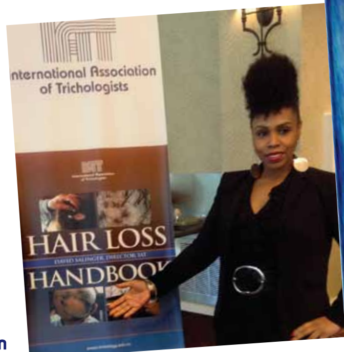
International Association of Trichologists

Further copies can be purchased at trichology.edu.au