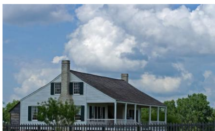
"Anson Jones House"

In spite of President Jones' opposition to annexation, the people of Texas voted in December of 1845 in favor of annexation.