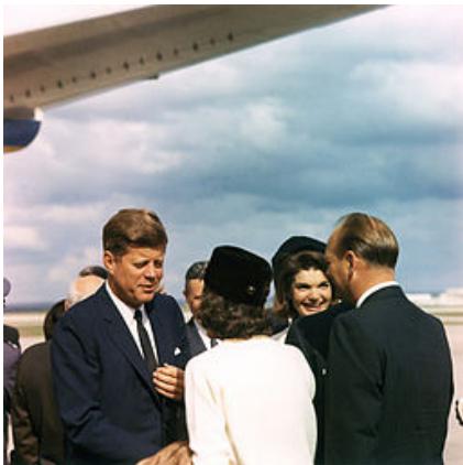
President John F. Kennedy and Jacqueline Kennedy arrive at San Antonio International Airport, San Antonio, Texas.

For many people in San Antonio, November 21, 1963 was almost as memorable as the day that followed, because President Kennedy paid a visit to the city. When San Antonio residents heard the news that the President had been shot while riding through the streets of