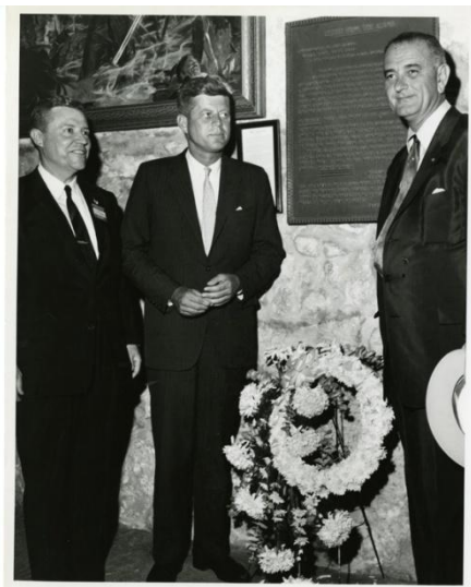
Sen. Yarborough, Kennedy and Johnson in the Alamo.