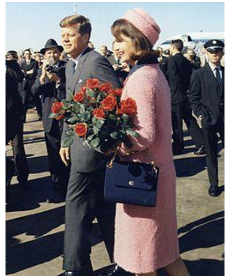
President John F. Kennedy and Jacqueline Kennedy arrive at Love Field, Dallas, Texas.

Those San Antonio school children are adults now, but like most Americans old enough to remember 1963, they could probably tell you everything they did on November 22nd. Unlike the rest of the country, however, they could also probably tell you exactly what they did on November 21st.