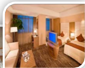
Above: Grand Metropark Hotel