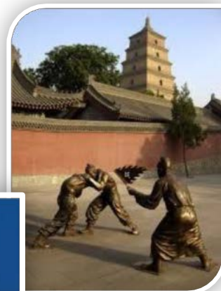
Big Wild Goose Pagoda

The itinerary will be identical to the Classic China Trip A.