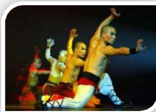
The Legend of Kung Fu