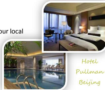
Hotel Pullman Beijing

Hotel Pullman Beijing West Wanda (5-star) No. Jia 18 Shijingshan Road, Shijingshan District Phone: (0086-10-88681188)