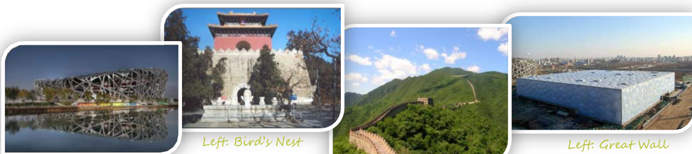
Left: Bird's Nest Above: Ming Tombs

Visit the 2008 Beijing Olympic venues for a view of the National Stadium (the Bird's Nest) and the National Aquatic Center. Continue the tour to the Great Wall and en route the buses will visit a jade factory . The Great Wall, 4,000 miles long and 2,000 years old, is said to be the only man-made structure visible to the naked eye from the moon. Visit the Ming Tombs - one of the 13 Ming Emperors' tombs is fully excavated and open for exploration. Enjoy a fabulous Peking roast duck dinner.