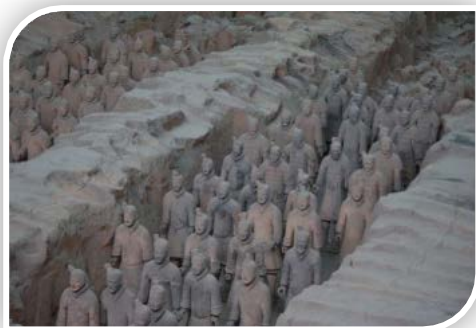
Left/Right Terra-Cotta Warriors

Morning bus excursion to the "Terra-Cotta Warriors and Horses", a collection of terra-cotta sculptures depicting the armies of Qin Shi Huang, the first Emperor of China. It is a form of funerary art buried with the emperor in 210–209 BCE and whose purpose was to protect the emperor in his afterlife. The figures, dating from approximately the late third century BCE, were discovered in 1974 by local farmers. On the way back visit the Huaqing Hot Spring Park and Banpo Museum