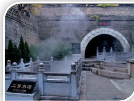
Above: Huaqing Hot Springs