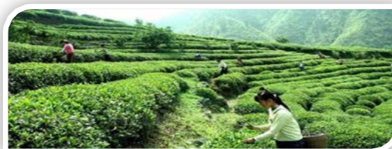
Longjing Green Tea Plantation

Renaissance Shanghai Putuo Hotel (5-star) No.50 Tongchuan Road, Putuo Distric Phone: (0086-21-22195888)