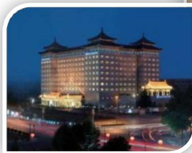
Grand Castle Hotel Xi'an

Grand Castle Hotel (5-star) HuanCheng South Road West Section 12, Xi'an, China Phone: (0086-10-888 734 8514)