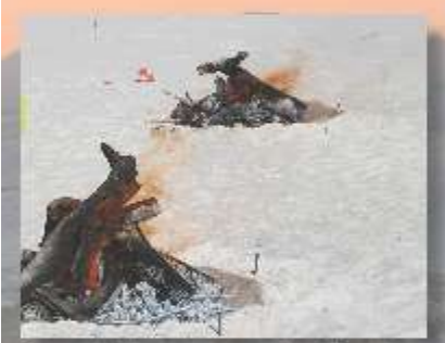
Controlled burn test to see how fire affects

Although wind and water are the primary forces that shape the environment at White Sands, humans have been coming here for thousands of years bringing with them another force for change—fire!