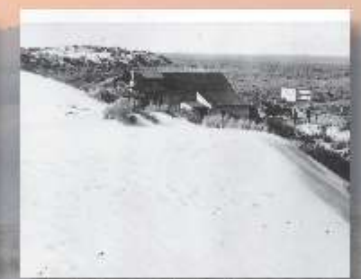
Historic image of the fhe Fetz Plaster Mill