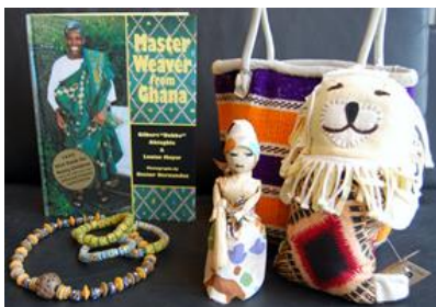
African-themed items are now available in the gift shop

The Museum Shop will offer a 30 percent discount for Guild volunteers on Nov. 19 from 1 – 3 pm following the Semi-Annual Luncheon. In addition, a 30 percent discount will apply in the shop from Nov. 24 through Dec. 8 for staff and Guild volunteers.