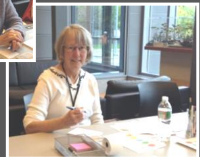
Guild of Volunteers Book Sale October 5 & 6, 2013