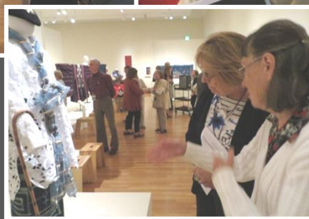
Africa Interweave Textile Diasporas Walkthrough October 1, 2013