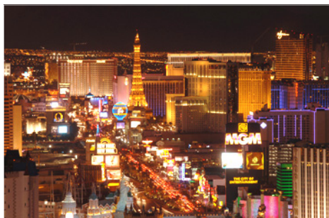
Las Vegas Strip

You'll enjoy an expanded continental breakfast at the hotel this morning before we travel to fascinating Bryce Canyon National Park. Upon arrival in