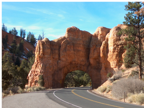
Bryce Canyon National Park

Today we travel to Utah to see the magnificent scenery of this region. We'll reach Zion National Park early this afternoon and experience the wonders of this awesome and unique natural treasure. Our first stop is at the Zion Park visitor's center, where you're free to have lunch on your own and explore Zion National Park aboard the park's shuttle tram service. This evening we check into the Zion Park Inn, located just outside the national park, for a two night stay. Dinner is on your own tonight at the hotel or at one of the nearby restaurants in the village.