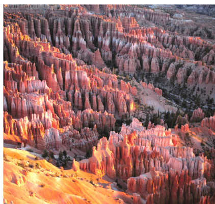
Valley of Fire

You'll again enjoy an expanded continental breakfast at the hotel this morning before we check out late morning and depart for the Valley of Fire, Nevada's first state park. We'll stop at the visitor's center before driving through this remote landscape filled with fiery red rock formations. From here we travel to Las Vegas for an overnight stay at the luxurious Paris Las Vegas Resort, located in the heart of the Las Vegas Strip. Dinner is on your own tonight. [B]