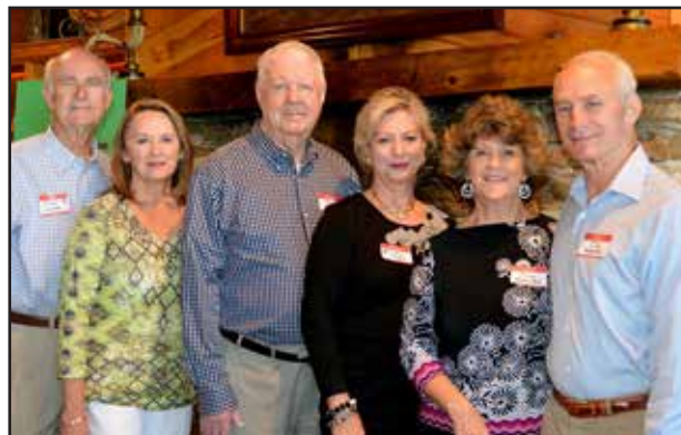
Hello to our new members. We are glad you're here!