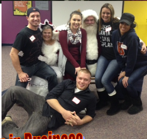
Right: Volunteers from Recovery Community, Inc. pose with Mr. and Mrs. Claus.

Next Women in Business Meeting January 6