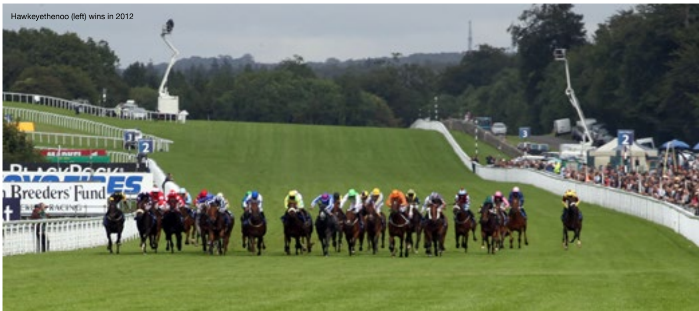
Hawkeyethenoo (left) wins in 2012

Since starting stalls were first used in 1966, the luckiest draw has been stall 11 with five winners coming from that position. Four winners have been drawn in 19. No winner has come from stalls 2, 3, 7, 13, 17, 23 and 24. The numbering of stalls was changed in 2011 for right-handed courses like Goodwood and means it is the opposite of before. Low numbers used to be on the right looking from the stands and now are on the left.