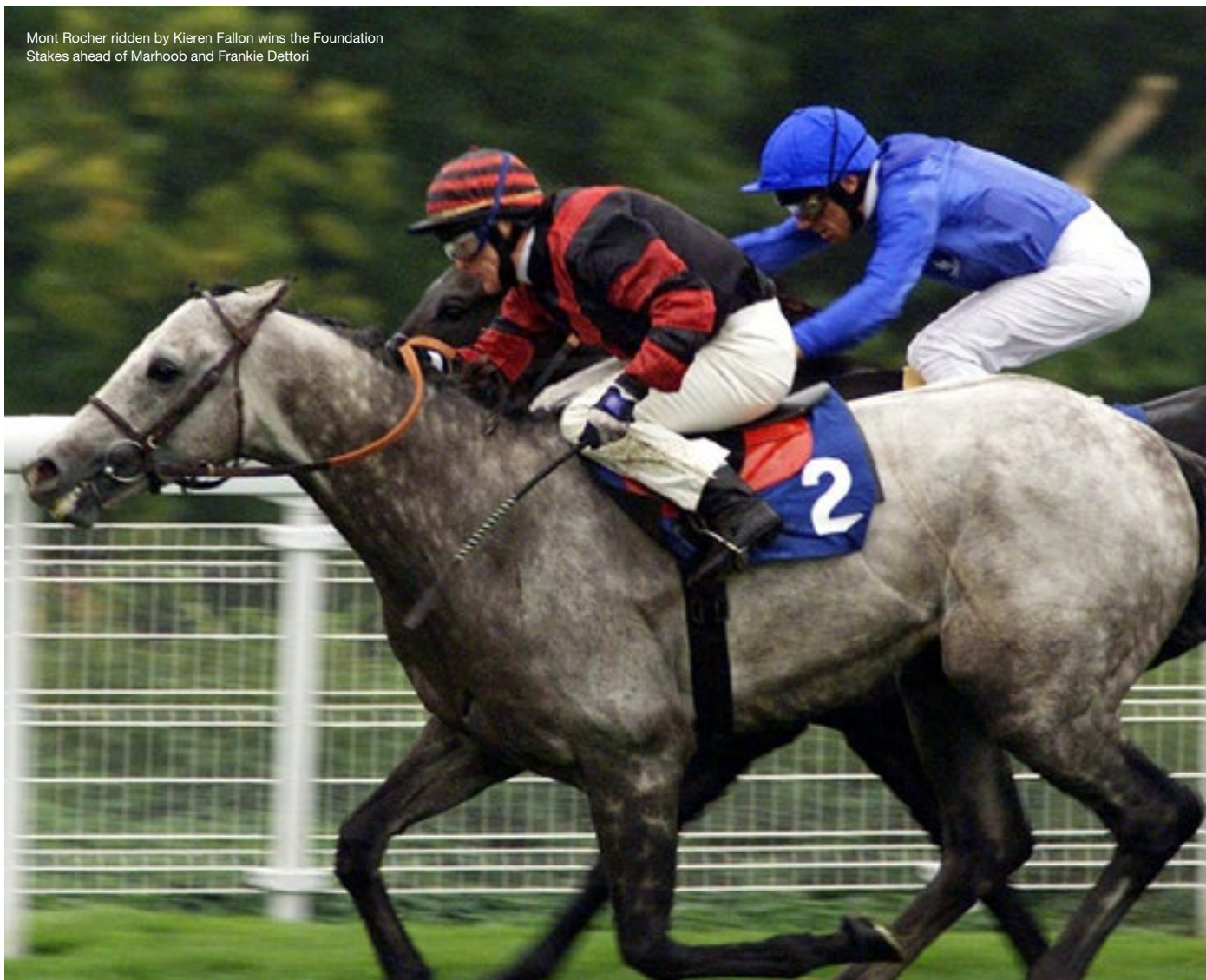
Mont Rocher ridden by Kieren Fallon wins the Foundation Stakes ahead of Marhoob and Frankie Dettori