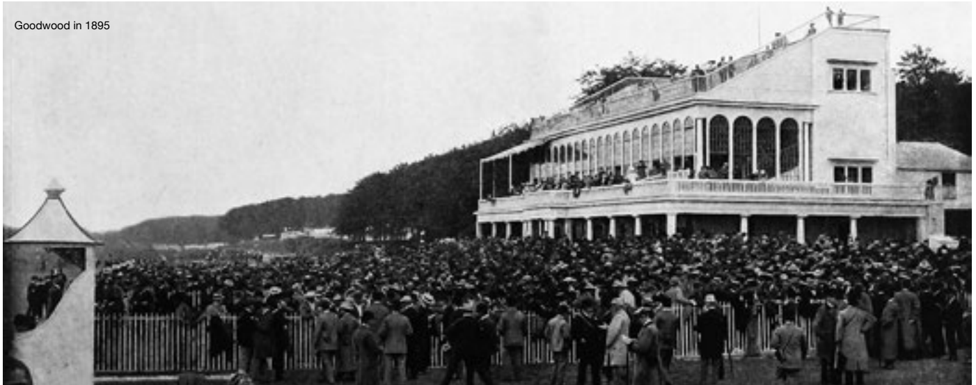
Goodwood in 1895

Duke, who served a term as President of the MCC, devoted much of his time to racing. He did a great deal to improve the racecourse, including the building of a new grandstand for 3,000 people in 1830.