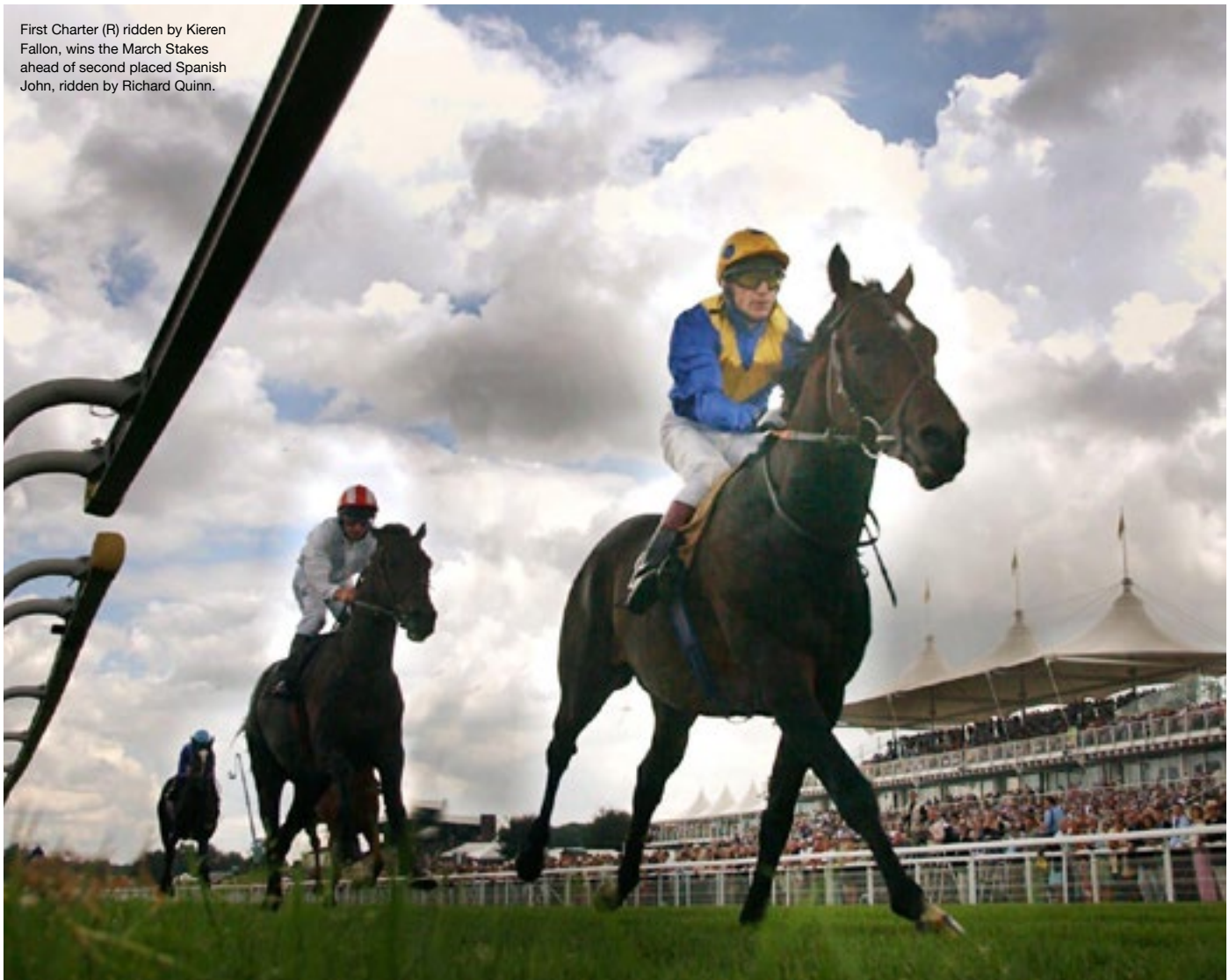
First Charter (R) ridden by Kieren Fallon, wins the March Stakes ahead of second placed Spanish John, ridden by Richard Quinn.

The 48 runnings have seen 22 favourites succeed, while the longest-priced victor was 9-1 chance Tungsten Strike in 2007.