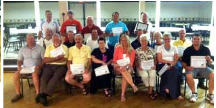
Some of the recipients of the appreciation certificates.