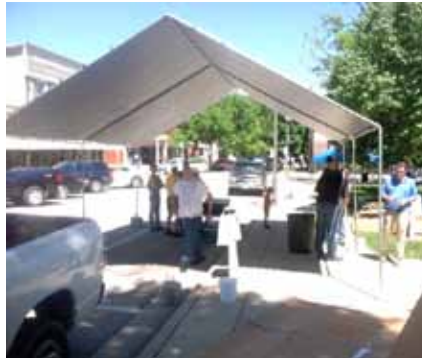
Set up on Friday night