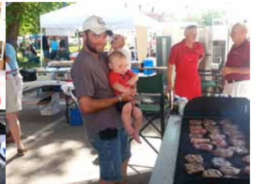
Thanks to all Moose members, wives and guests for helping.