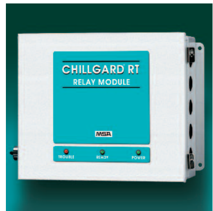
Chillgard RT Refrigerant Monitor Relay Module