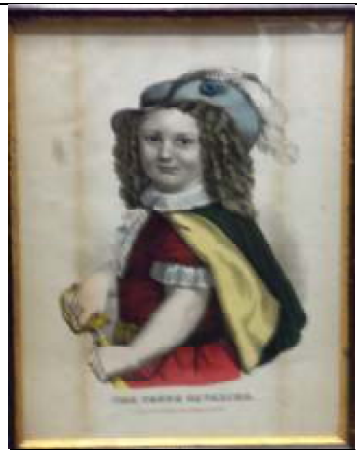
The Young Cavalier by Courier & Ives

The Tulare Historical Museum is pleased to announce our next exhibition in our Heritage Art Gallery from October 2nd - November 1st. We will be showing personal THM Artwork from the museum's "Vintage Art Collection."