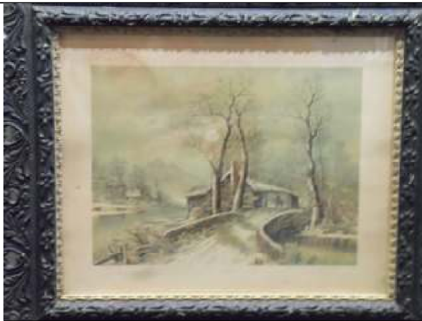
Unknown by J. Hoover, 1894