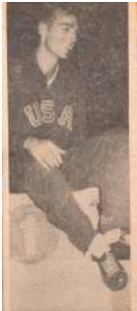
CHAMPION AGAIN—Bob Mathias, Tulare's scholastic wonder-boy, is Helsinki today set a new Olympic distance mark and became the first man in Olympic history to win the title twice. The towns are celebrating today, and Visalia join them in spirit. This great star has a Tulare address, but he belongs to the world, and as such the country that claims a share in celebrating his great triumph today.