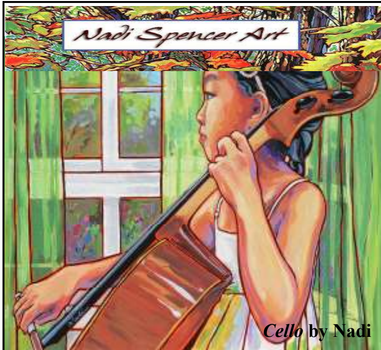
Cello by Nadi