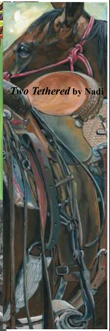
Two Tethered by Nadi