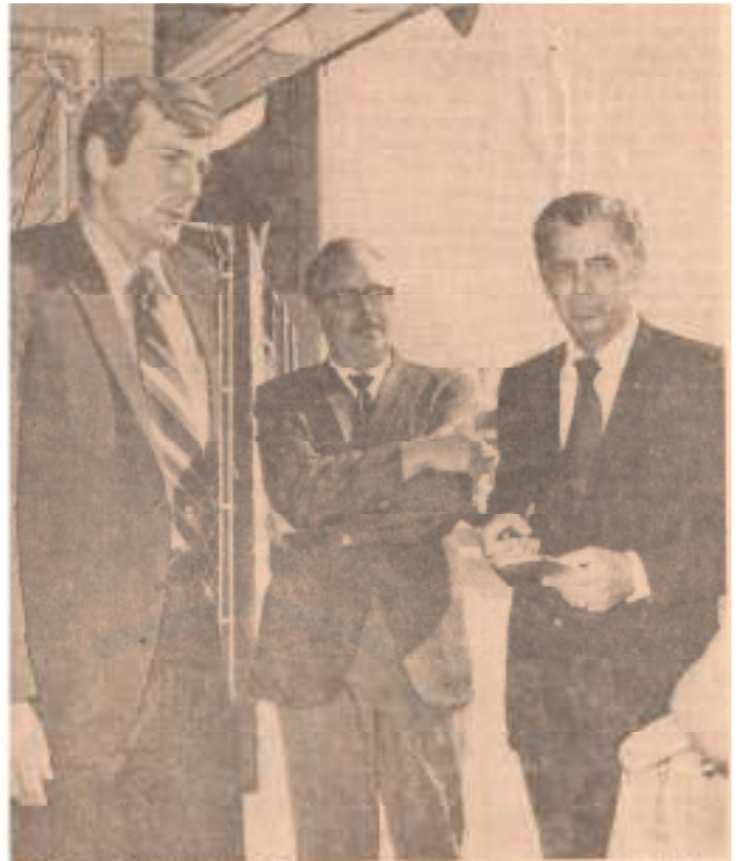
CELEBRITY GUESTS — At (left) center, secretary-manager of the Tulare County Fair, one of the gate personality to greet two high level guests, Agriculture Secretary Clifford Hardin, right, and Rep. Bob Mathias, 2-Vicilla.