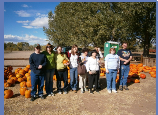
Osborn Farm, Oct. 2011

The CLS community enjoyed our beautiful autumn weather here in Colorado. Day Program participants visited Osborn Farm, in Loveland, CO, where the owners generously donated pumpkins to us. CLS participants then had fun carving and decorating them for Halloween. Thank you, Osborn Farms, for supporting our organization.