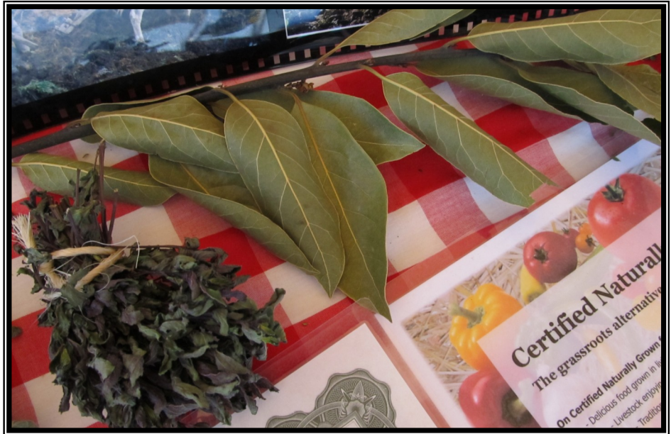
Hernandez Larsen Family Farm