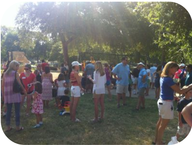
Incoming kindergarten families mingle at Popsicles in the Park.

A longstanding Tanglewood tradition, Kindergarten Popsicles in the Park was held Saturday, August 24 in the park across the street from the school.