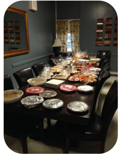
Parents donated sixty-six pies for the annual Thanksgiving Pie Event.

Many parents were busy baking pies for the annual Thanksgiving Pie Event. Sixty-six pies were provided by our awesome parents so that each teacher and staff member could take home a pie for the Thanksgiving Holiday. The teachers love this event and were so thankful!