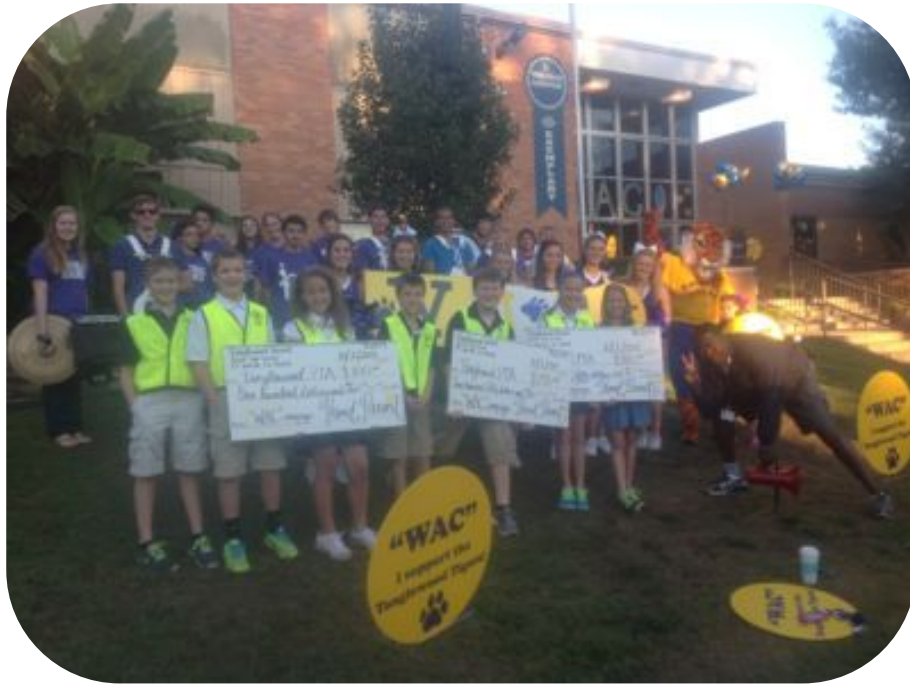
The Pashcal High School Band was on site to help kick off our annual fall fundraiser.