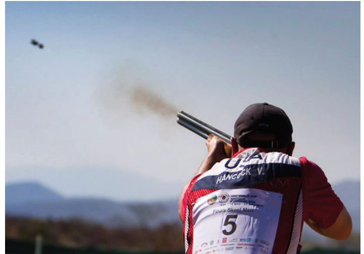
Skeet shooter and two-time Olympic gold medalist Vincent Hancock competes in the ISSF World Cup in Acapulco, Mexico.

Given athlete longevity in the shooting sports, the cupboard is far from bare for the USA Shooting Team as the focus turns to the