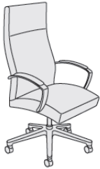
High Back, Metal Arm with Poly Arm Cap, Metal Base