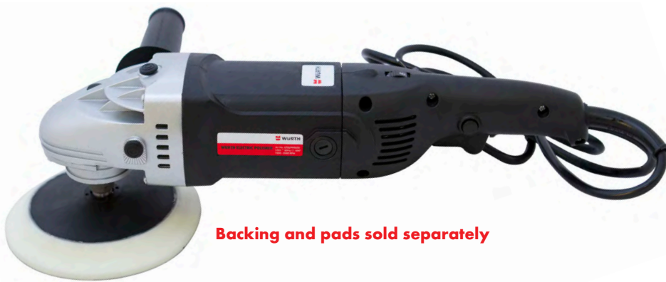
Backing and pads sold separately

Easy to use polishing machine which includes a D-Handle and a Straight handle which can be attached on either side of the machine to accommodate both left and right handed technicians. The variable speed motor can go from 0-3000 rpm and can be controlled with the trigger switch so that the operator can control the amount of cut and polishing that the machine will output. The 11 Amp motor is strong enough for deep polishing jobs without the machine losing speed.