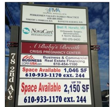
The Colledgeville sign with leaders last summer (left); the Colledgeville sign now (above)