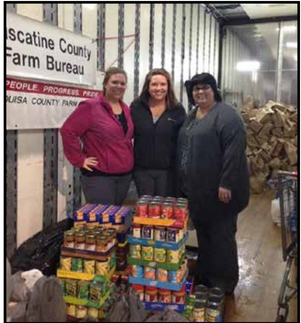
Central State Bank employees donated their food items to the Hawkeye Trailer at Hy-Vee during the first week of the Two Weeks of Love campaign. All food donations went to the Salvation Army of Muscatine.