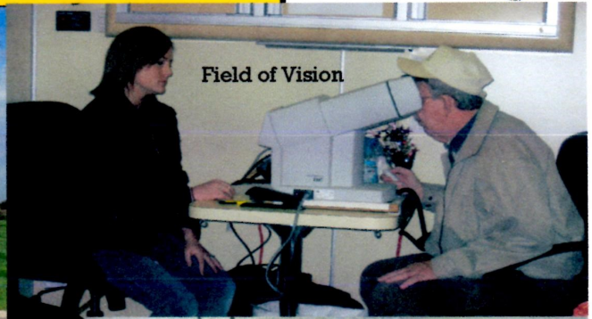
Field of Vision