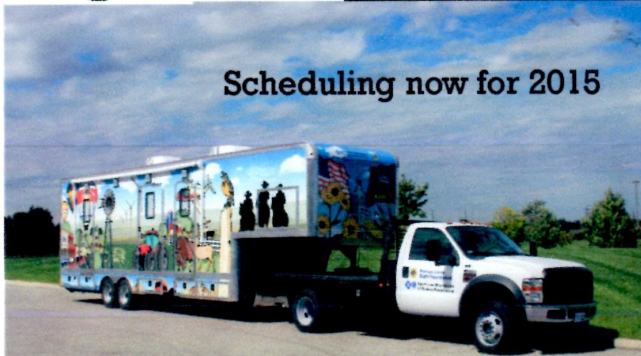
Scheduling now for 2015