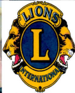
Vision Screening starting at six months