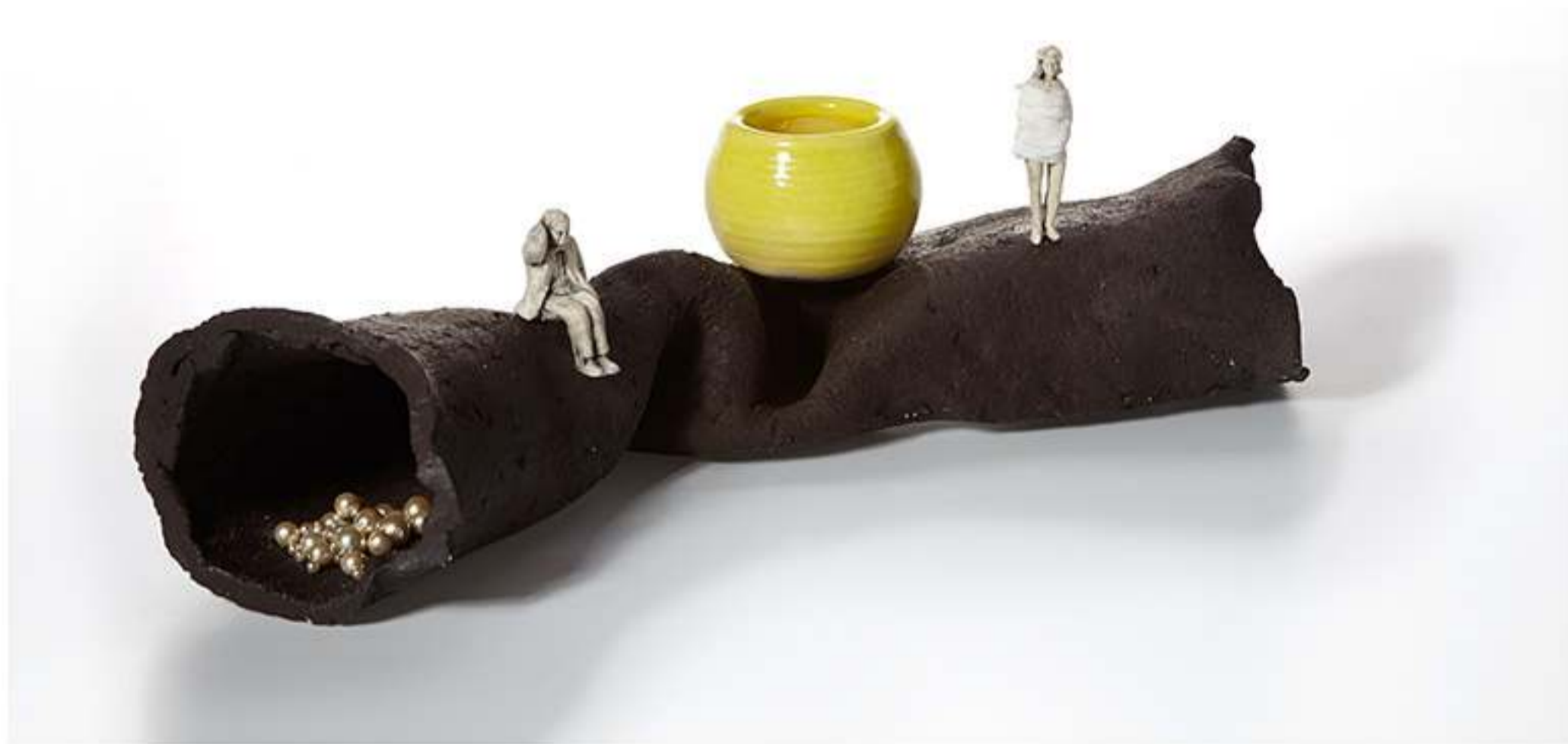
She Posed a Dramatic Question, 2014 Extruded black clay, thrown porcelain, slip cast, stain, glaze and mixed media 14.5x39cm