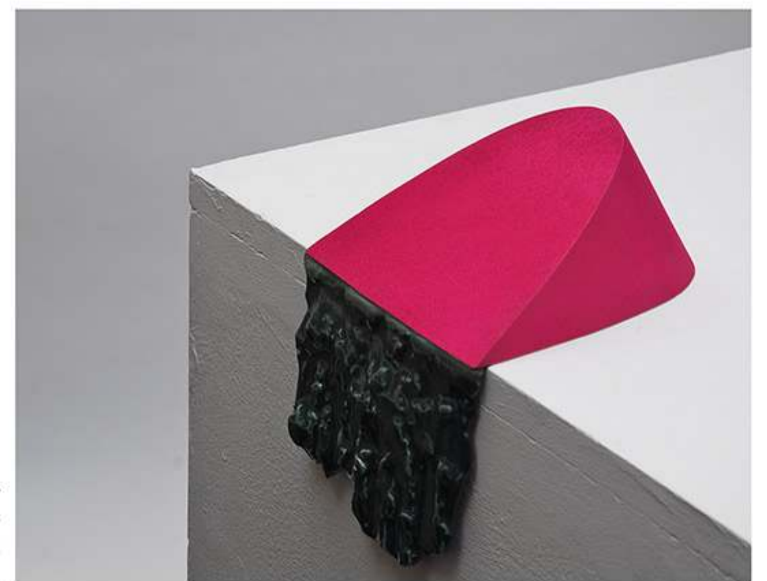
Spill Series, Pink and Green, 2014 Ceramic, with earthenware glaze and acrylic paint 20 x 14 x 17cm