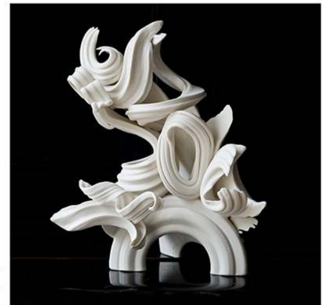
Ensemble III, 2014 Porcelain 28 x 21 x 19cm