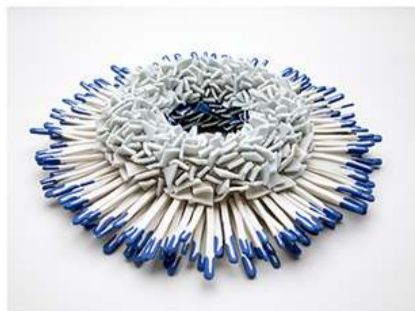
Blue & White Porcelain Shards Flower. No.2, 2014 Porcelain shards, fired clay 6 x 22 x 22cm