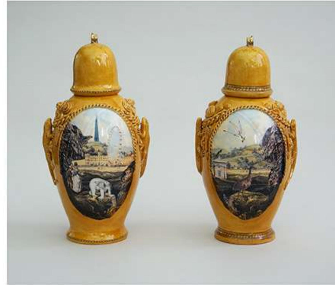
Catfishing, 2014 Ceramic 32 x 10 X 15cm (each) NFS - Commission Available