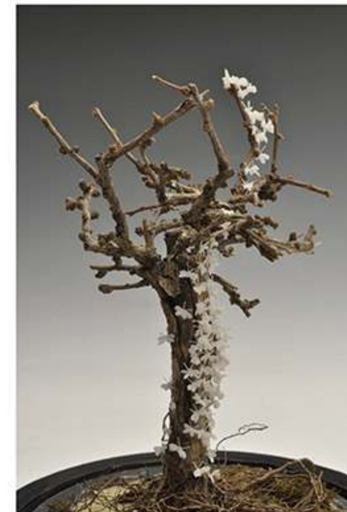
Wings of gentle flush, 2010 Porcelain 30 x 20cm