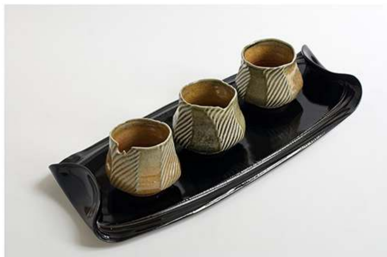
Black Platter and Shino Bowls, 2014 Porcelain 25 x 53 x 6cm (Platter) 13 x 13 x 9cm (Bowls)