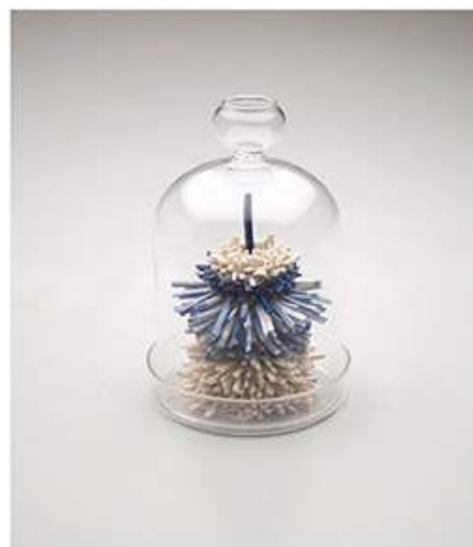
Small Blue & White Flower. No.3, 2014 Porcelain shards, fired clay 17 x 10 x 10cm