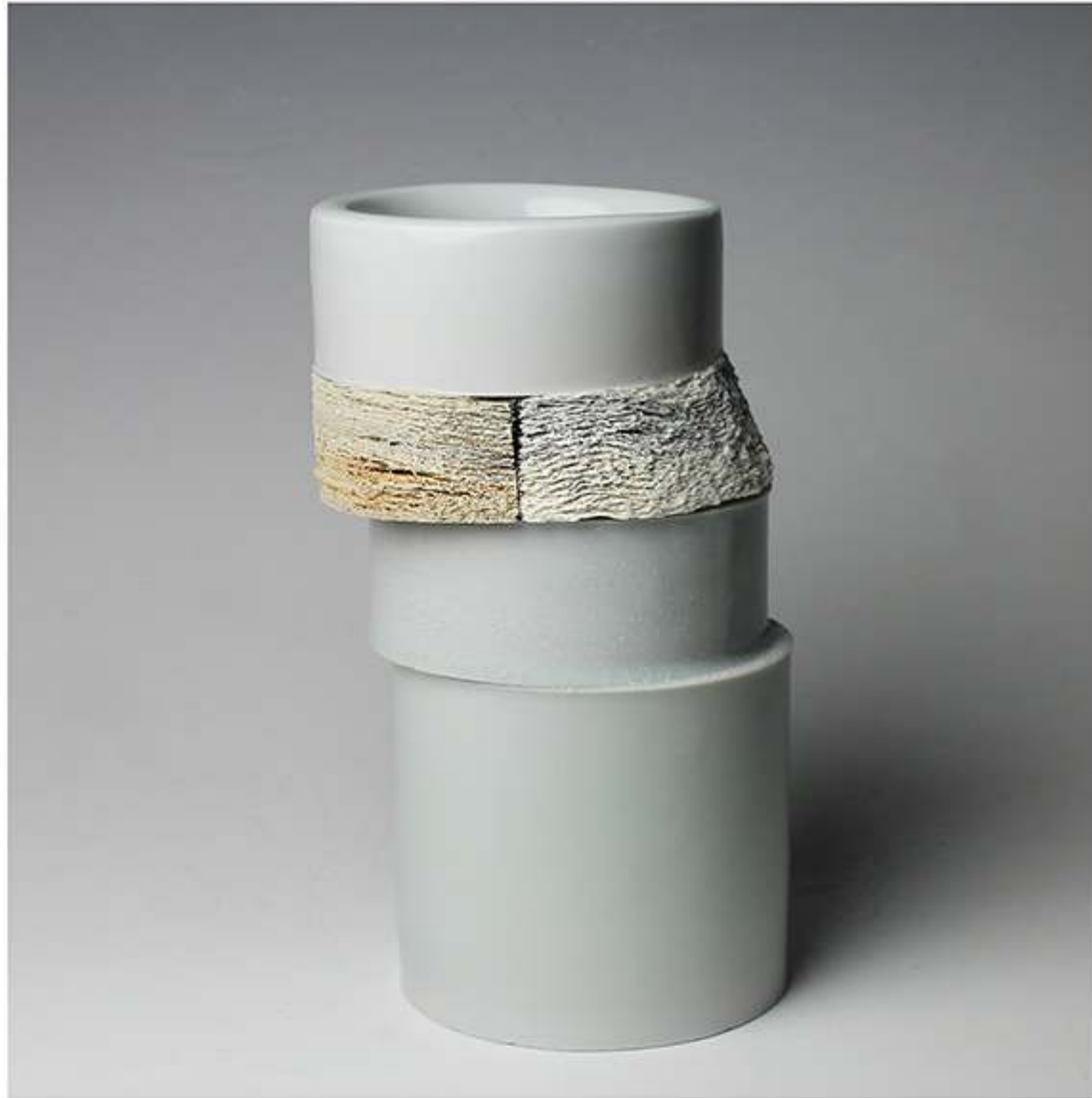
Definitely Ceramics II, 2014 Porcelain, stoneware with newspaper, celadon glaze 20 x 17 x 32cm