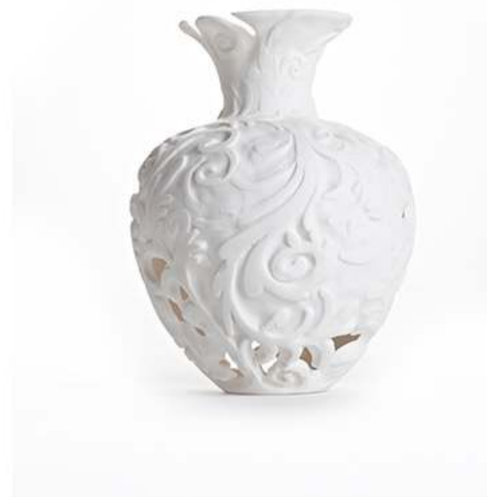
Vanitas VII, 2012 Parian porcelain 20 x 15cm