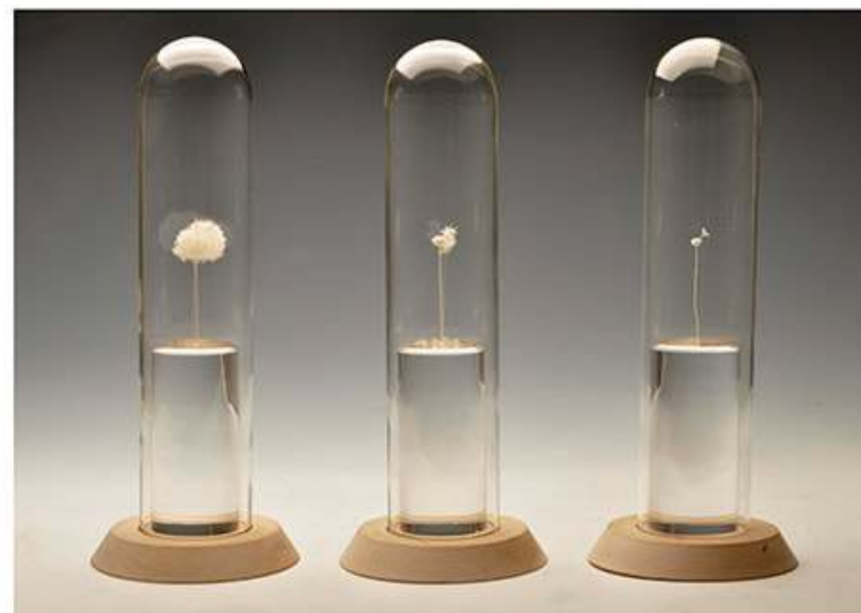
Fleeting Sense of Time, 2010 Porcelain 7 x 3cm (each)