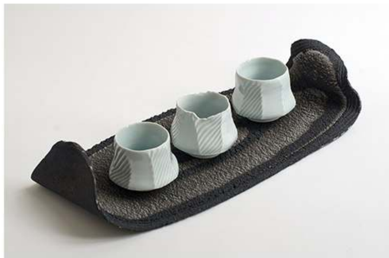
Monochrome Platter and Celadon Bowls, 2014 Black Stoneware, Porcelain, Celadon 56 x 27 x 9cm (Platter) 13 x 13 x 9cm (Bowls)