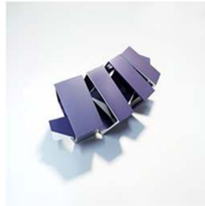
Titan 4, 2014 Porcelain Edition of 5 16cm H x 36cm W x 14cm D