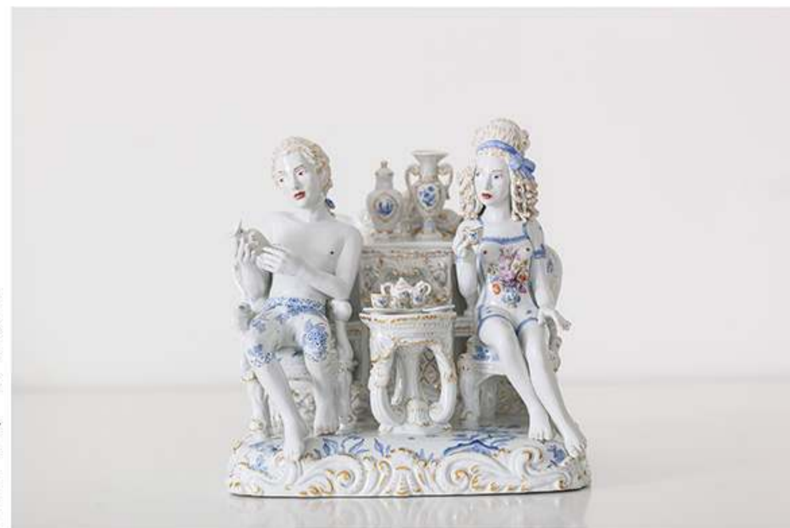
Ambrosia, 2014 Edition of 25 Porcelain 28 x 26 x 23cm

Courtesy of MEISSEN COUTURE® Europe's most tradition-rich house of fine art and hand-crafted luxury.