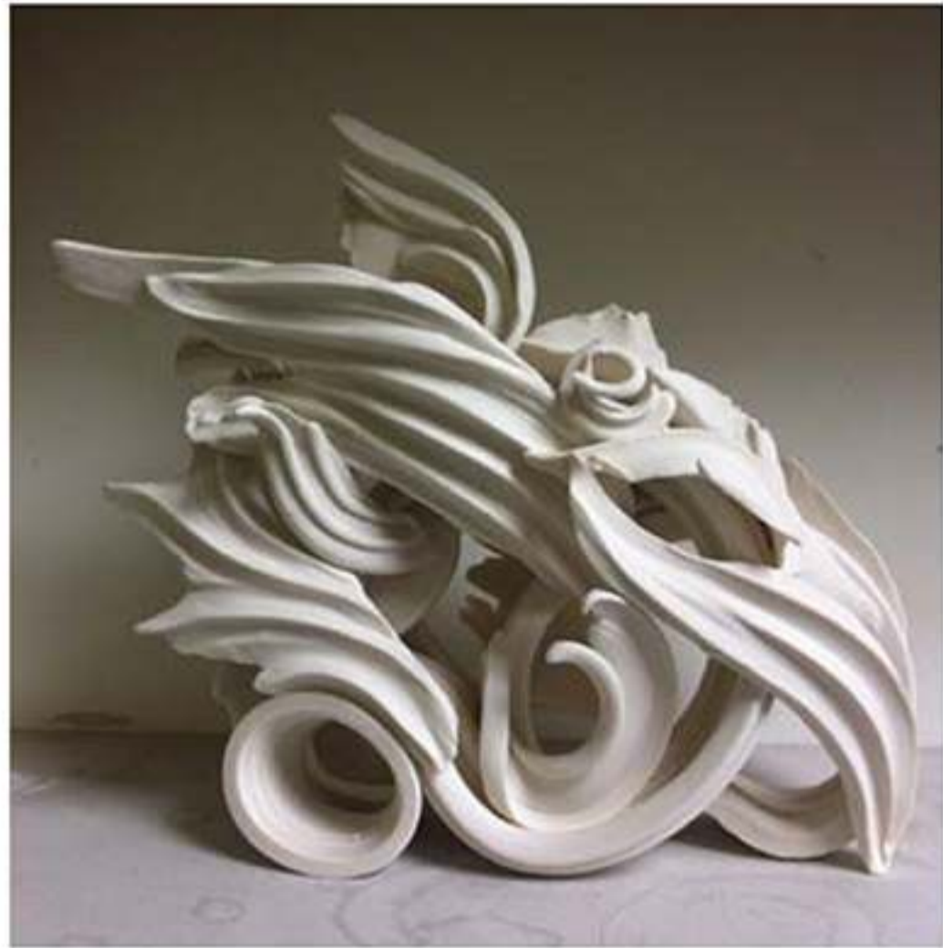
Mercurial I, 2014 Porcelain 26 x 27 x 10cm