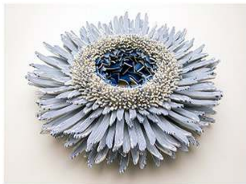
Blue & White Porcelain Shards Flower. No.1, 2014 Porcelain shards, fired clay 12 x 27 x 27cm