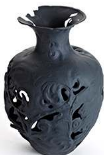
Vanitas IV, 2012 Porcelain 27 x 19cm