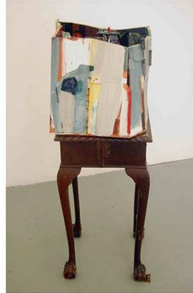
You Will Marry the First Person Who Tells You Your Eyes Are Like Scrambled Eggs, 2011 Sculpture in clay & wood 117 x 40 x 40cm NFS - Commission Available