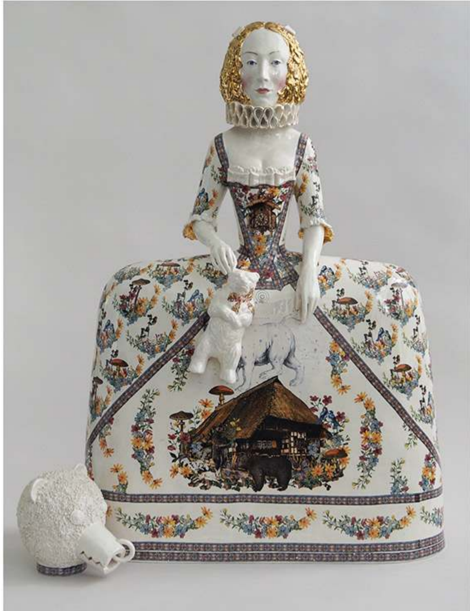
Goldilocks, 2014 Ceramic 70 x 50 x 21cm NFS - Commission Available