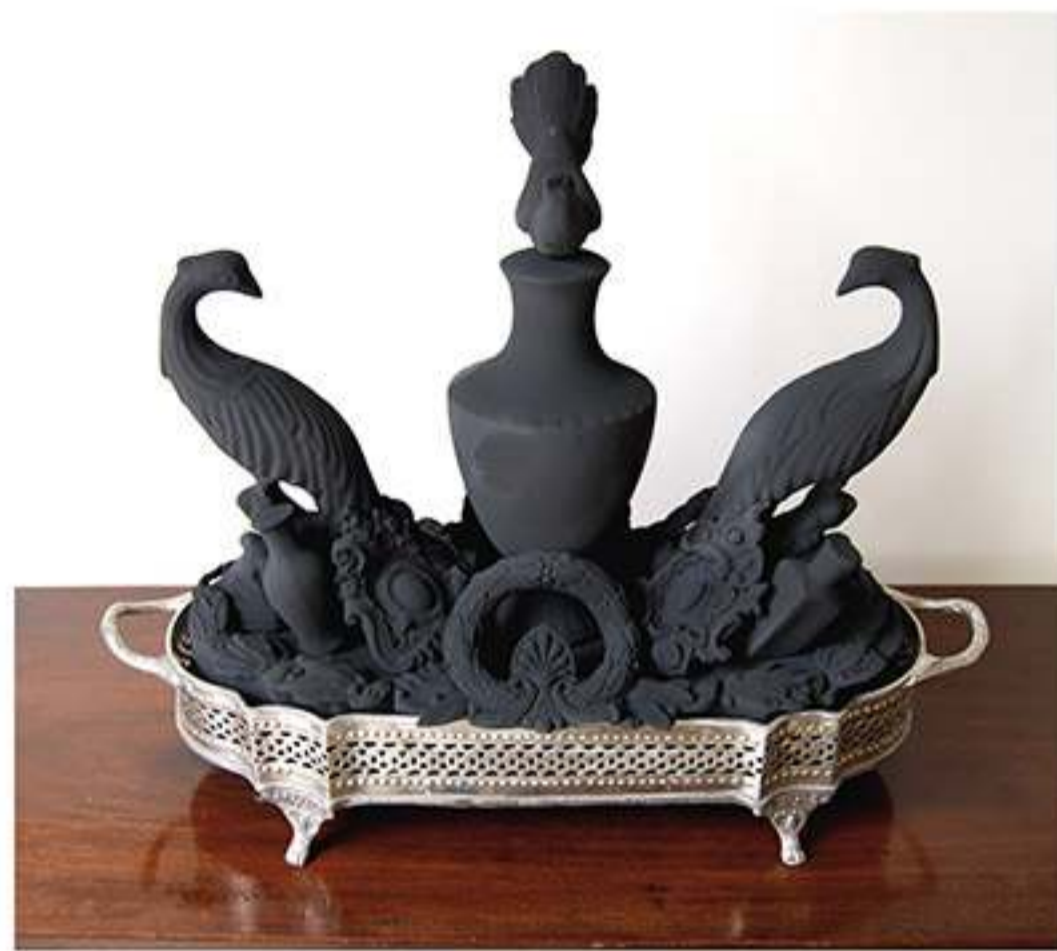
Feast Part I, 2014 Ceramic and found silver plate stand 42 x 56 x 23cm