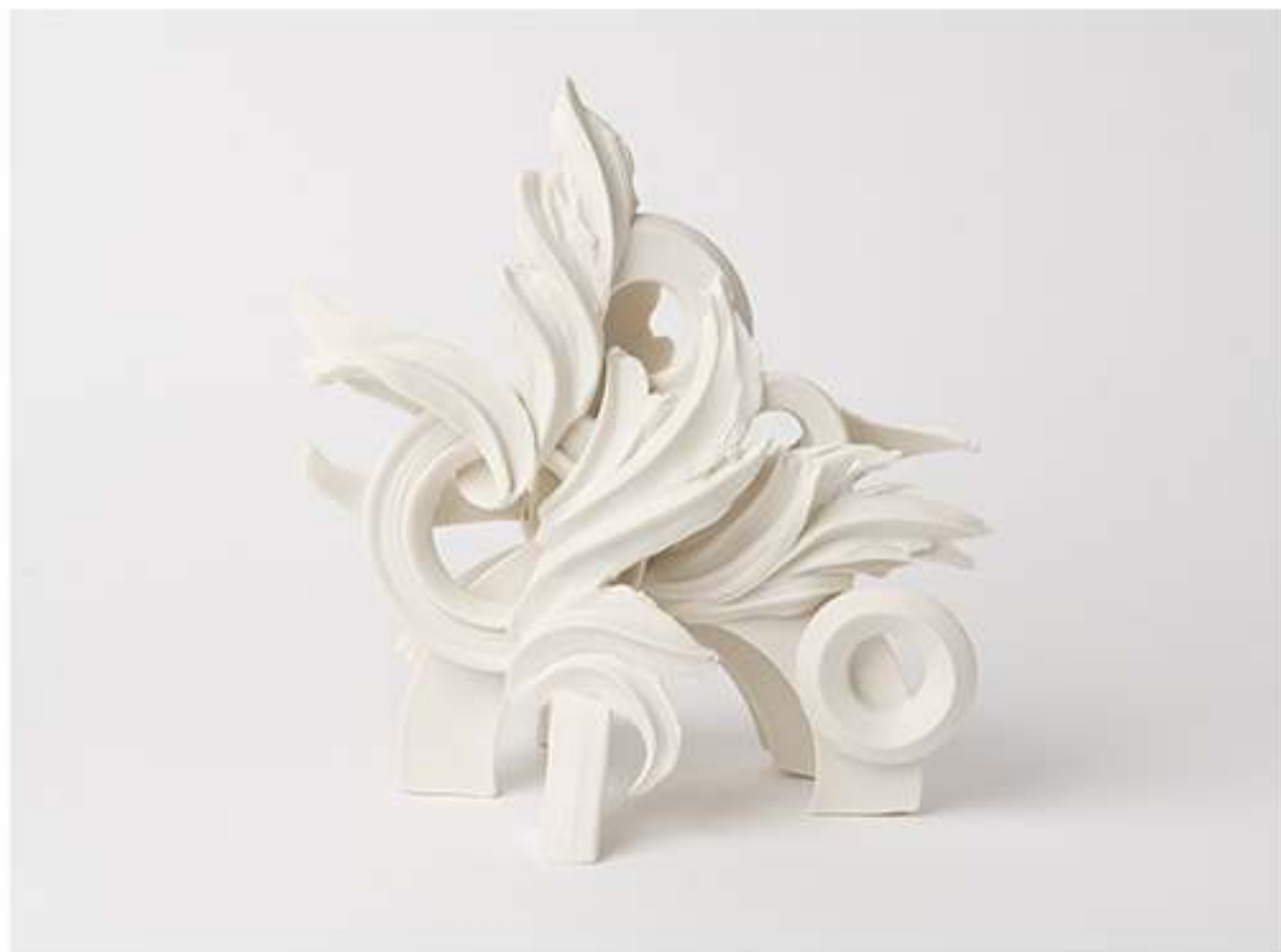
Conclave III, 2014 Porcelain 24 x 24 x 17 cm