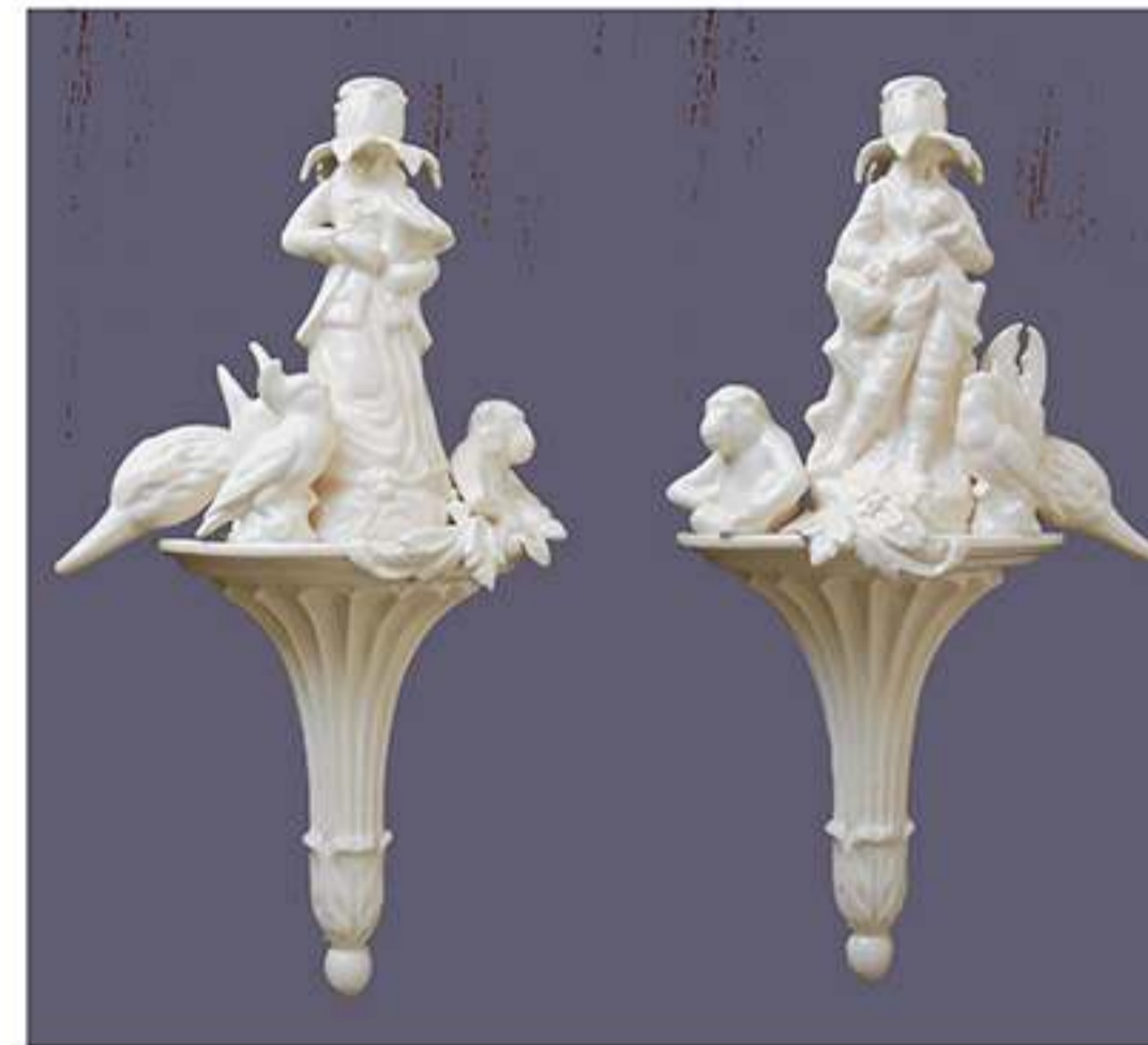
Pair of Wall Sconces, 2014 Ceramic 58 x 32 x 13cm