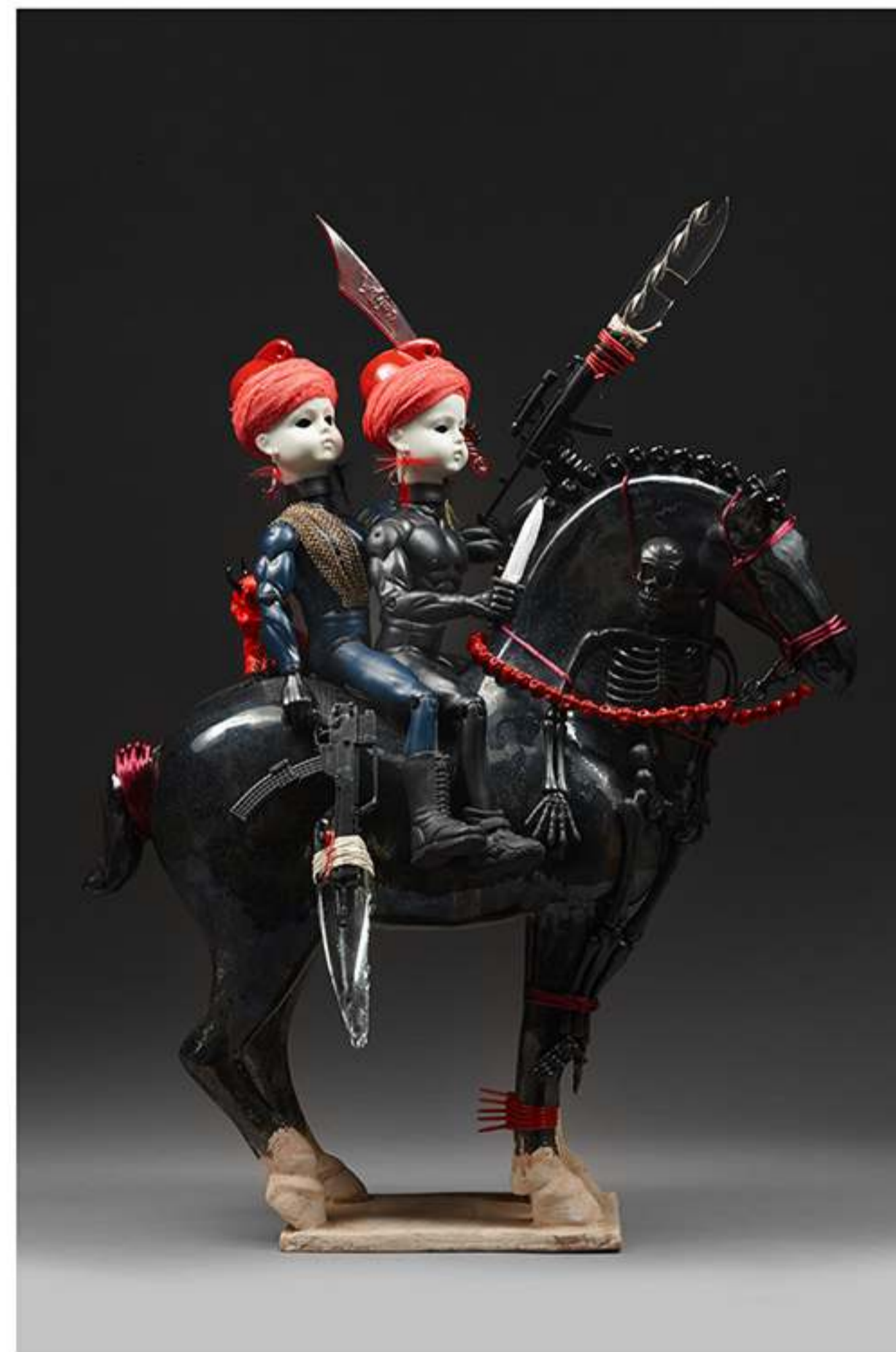
Devils on Horseback, 2014 Replica tang horse, vintage dolls and accessories 63 x 51 x 23cm