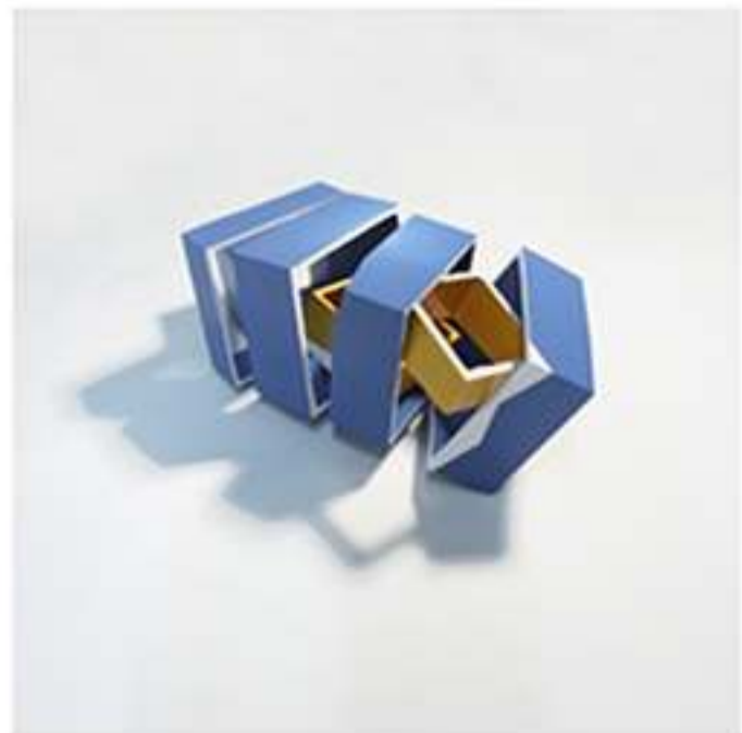
Titan 5, 2014 Porcelain Edition of 5 16cm H x 36cm W x 14cm D