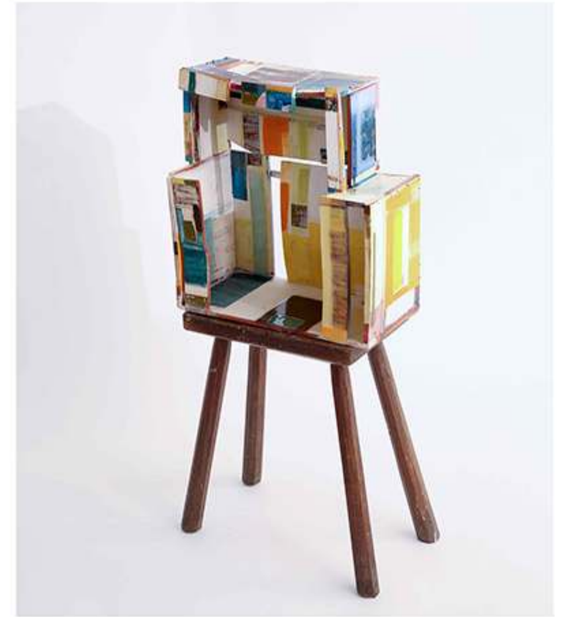
You Will Eat Cake, 2014 Sculpture in clay & wood H76cm x W38cm x D23 cm NFS - Commission Available