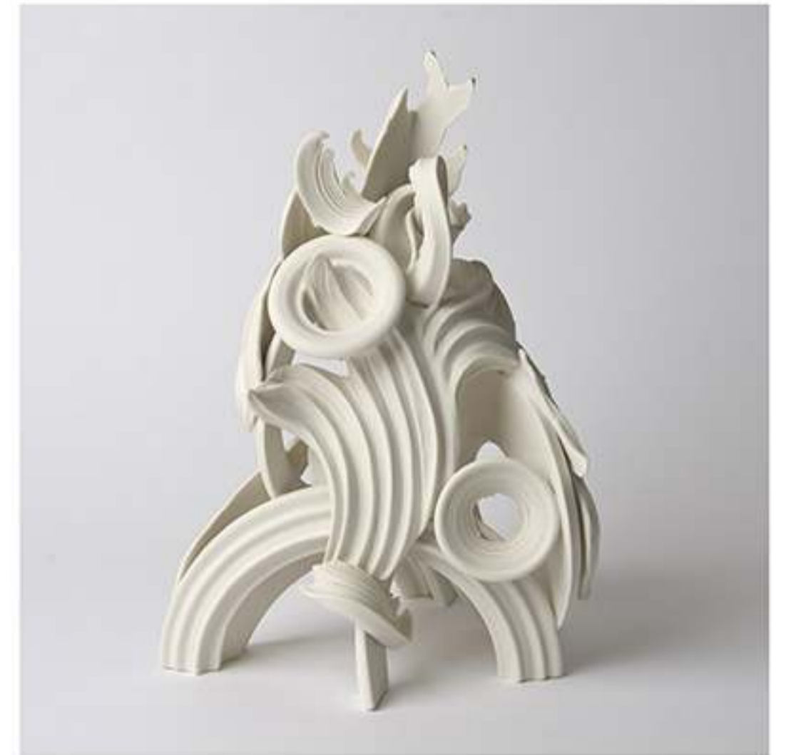
Capricious II, 2014, Porcelain 35 x 22 x 24cm