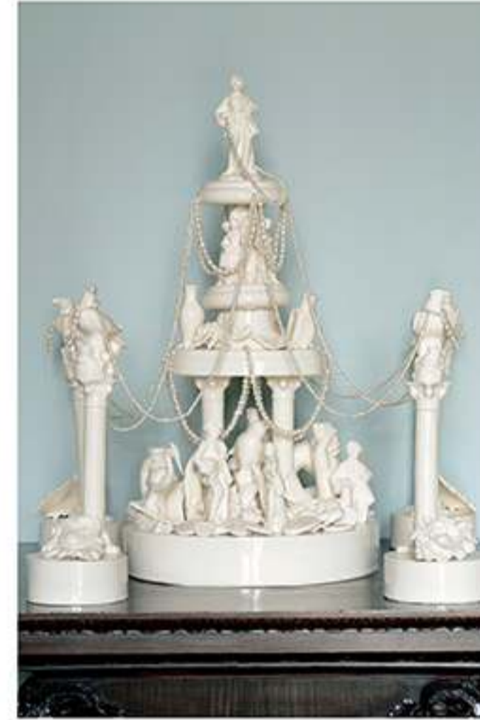
The Gift, The Vyne National Trust Commission, 2013 Ceramic and freshwater 90 x 90 x 90cm