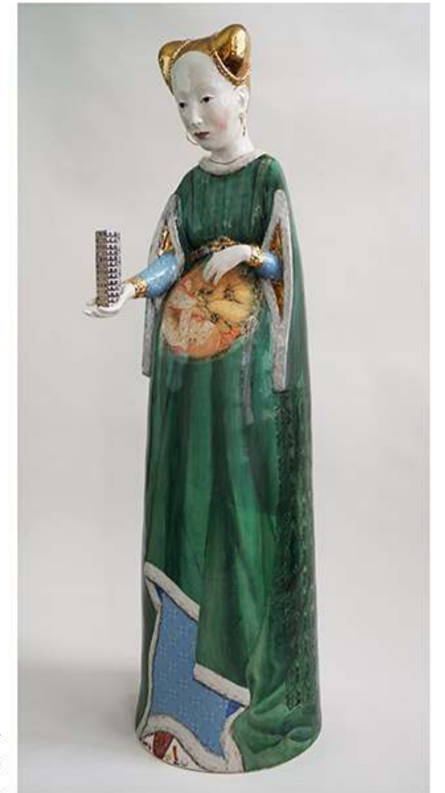
The Urban Planner, 2014 Ceramic and mixed media 89 x 24 x 30cm