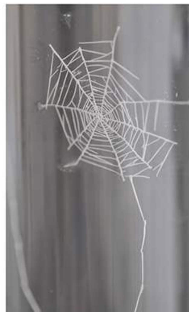
Illusion, 2010 Porcelain 5 x 6cm