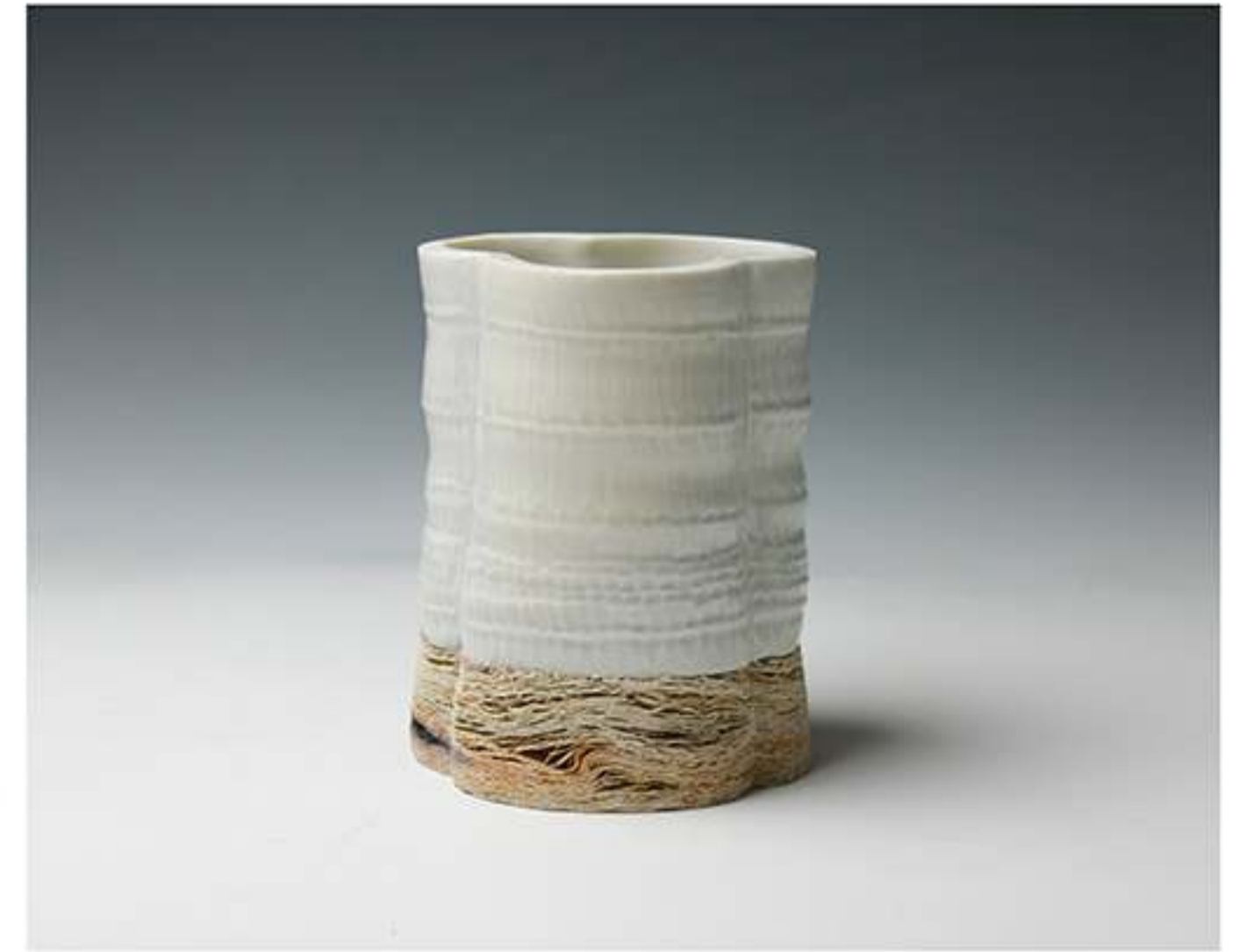
Definitely Ceramics I, 2014 Porcelain, stoneware with newspaper, celadon glaze 18 x 12 x 12cm