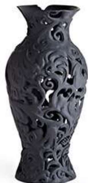
Vanitas III, 2012 Porcelain 37 x 18cm