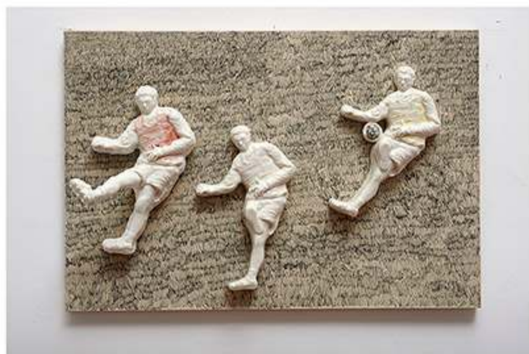
Pardon Me, There is a football Match tonight? 2014 Porcelain, Enamel, Wood 30 x 45 x 5 cm