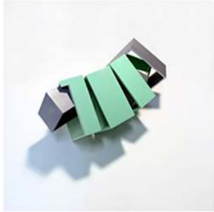
Titan 3, 2014 Porcelain Edition of 5 16cm H x 36cm W x 14cm D