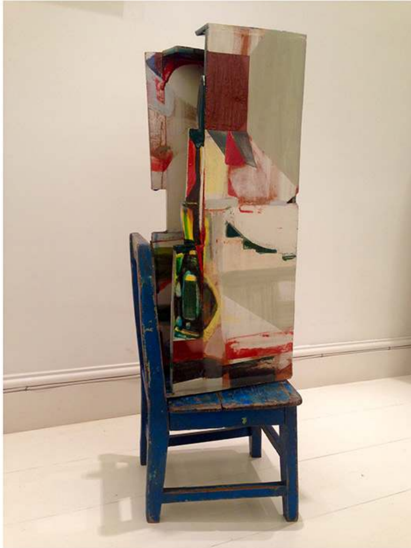
It's Difficult To Think of You Without Me In The Sentence, 2014 Sculpture in clay & wood H 90cm x W 26cm x D 38cm