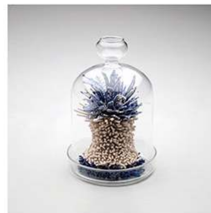
Small Blue & White Flower. No.1, 2014 Porcelain shards, fired clay 17 x 10 x 10cm