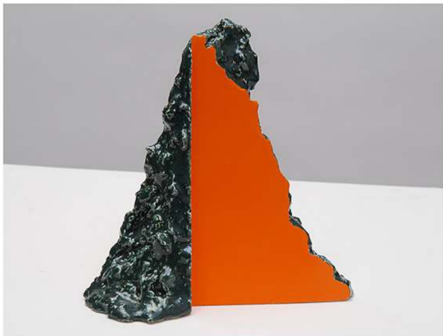
Absence Series, Tangerine and Green, 2014 Ceramic, with earthenware glaze and acrylic paint 17 x 16 x 12cm