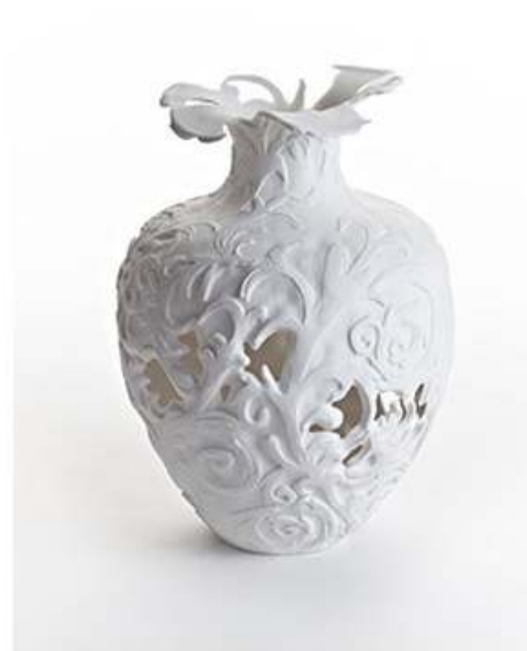
Vanitas II, 2012 Bone china 27 x 19cm