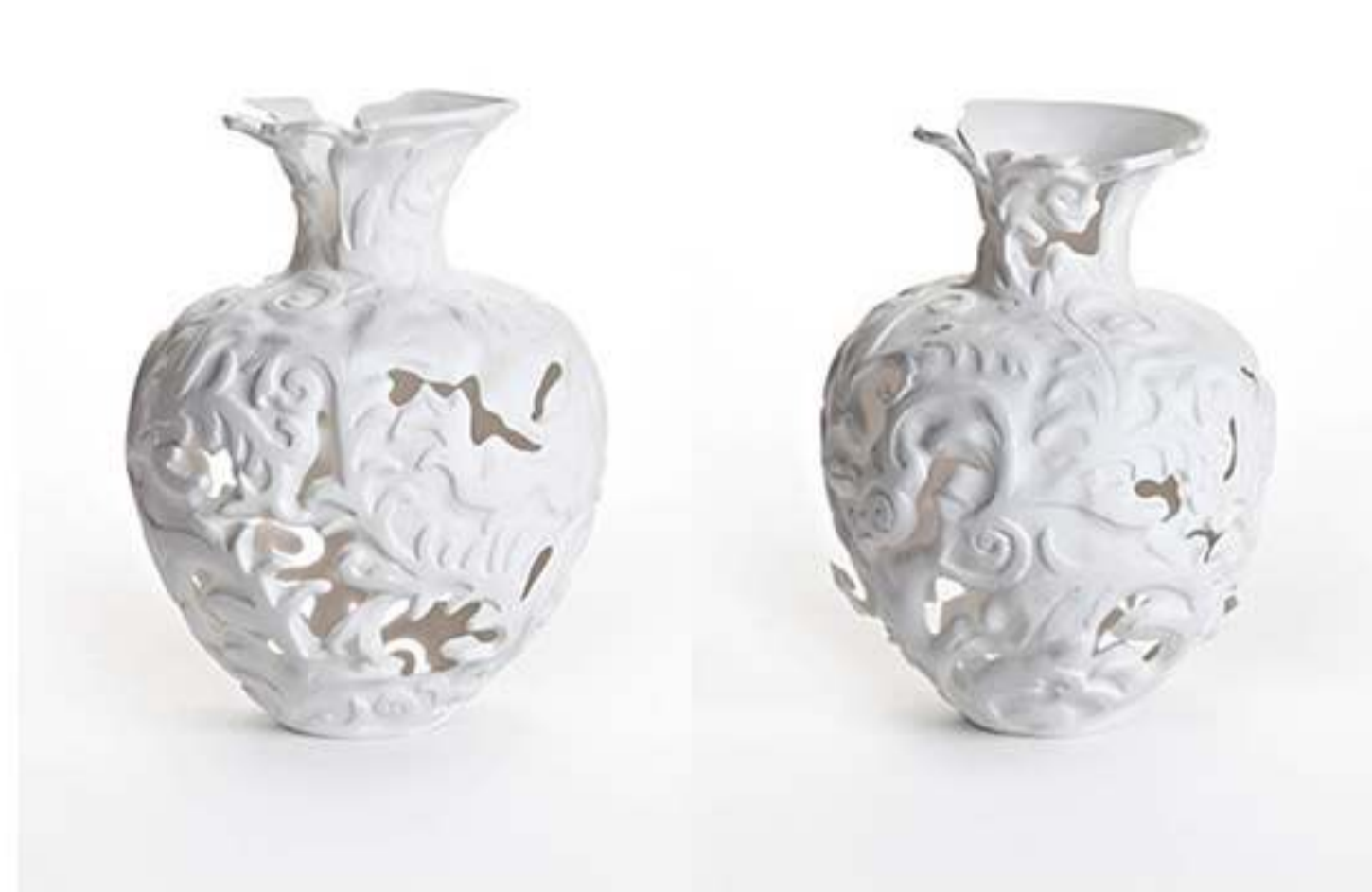
Vanitas I, 2012 Bone china 20 x 15cm