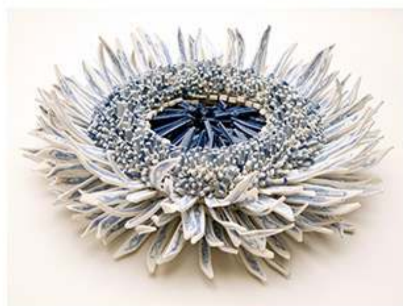
Blue & White Porcelain Shards Flower. No.3, 2014 Porcelain shards, fired clay 8 x 22 x 22cm