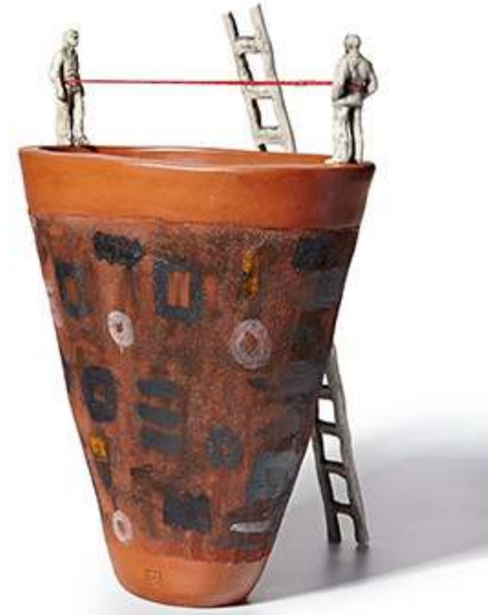
Balancing Powers at Dizzying Heights, 2014 Handbuilt earthenware and porcelain, stains, glazes, slip cast and string 35x28cm