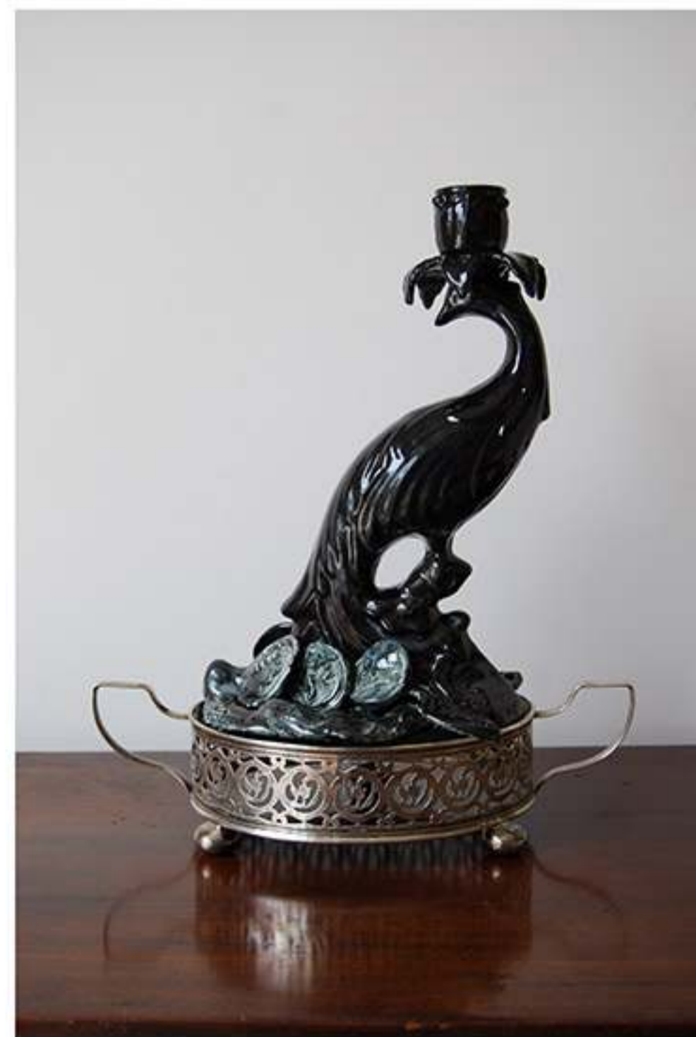
Feast Part III, 2014 Ceramic and found silver plate stand 36 x 30 x 19cm