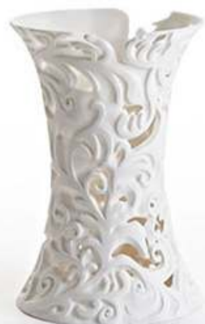
Vanitas V, 2012 Parian porcelain 14.5 x 16.5cm