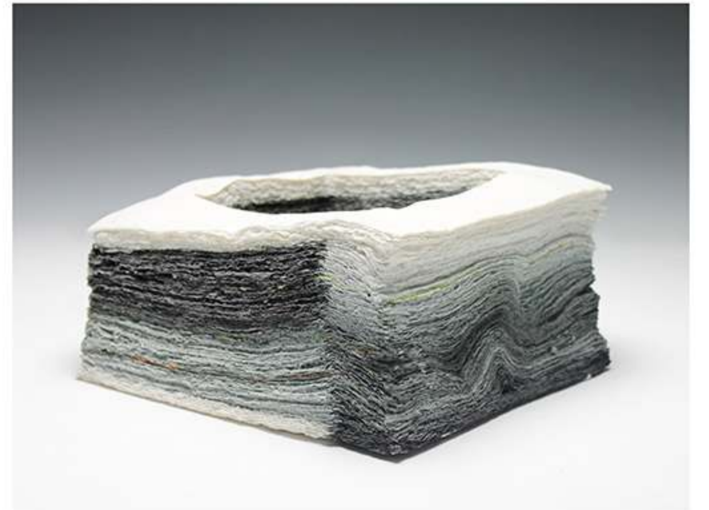
Artistic Stratum, 2014 600 sheets of tissue paper, porcelain with colour stain 18 x 18 x 10cm