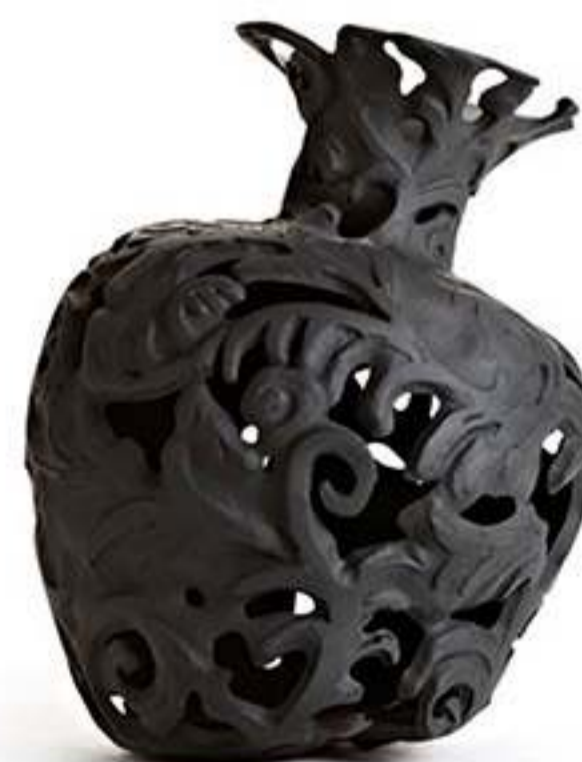
Vanitas XIV, 2012 Porcelain 20 x 15cm