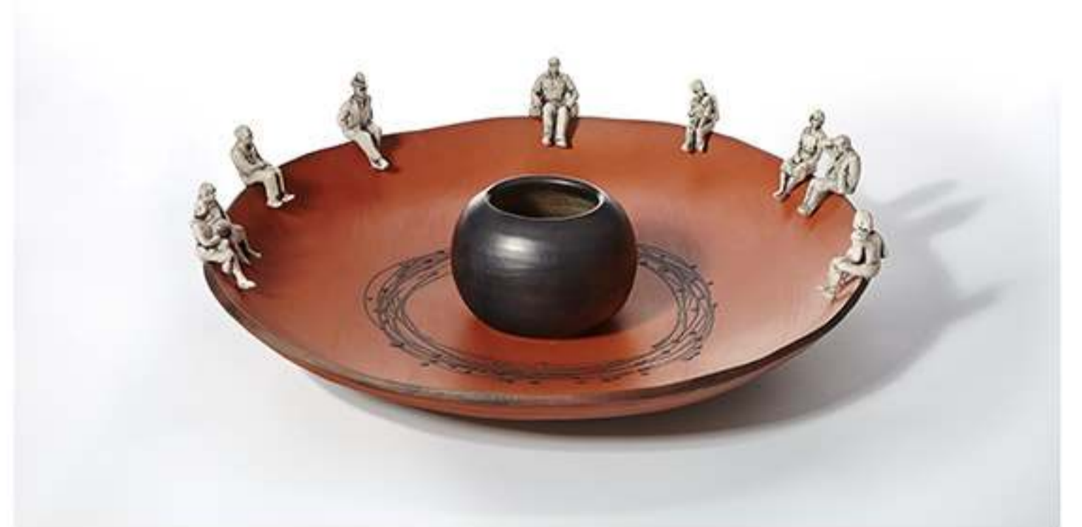
The Gaps In Between, 2014 Slip cast earthenware, thrown porcelain, slip cast, slip, stain, glaze 14x35cm