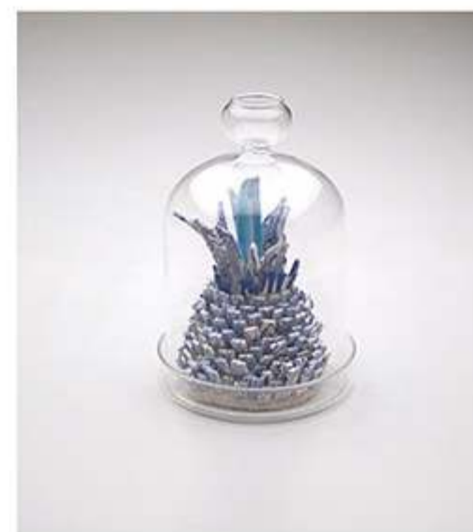
Small Blue & White Flower. No.2, 2014 Porcelain shards, fired clay 17 x 10 x 10cm