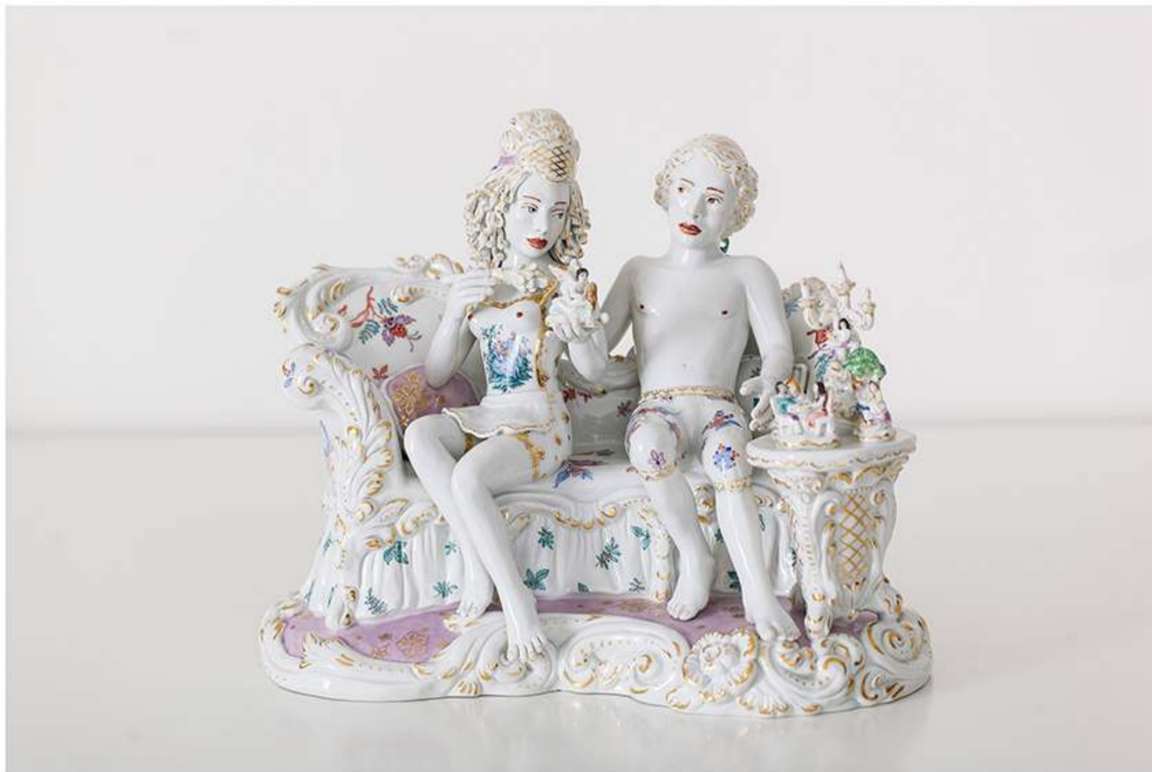
A Delicate Domain, 2014 Edition of 25 Porcelain 26 x 32 x 20cm

Courtesy of MEISSEN COUTURE® - Europe's most tradition-rich house of fine art and hand-crafted luxury.