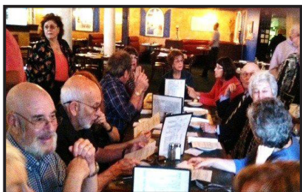
Left: SPICE members enjoying dinner at Greek Isles before a performance of "Bloody, Bloody Andrew Jackson" at Actors Theatre at the first SPICE NIGHT OUT program on October 3rd.