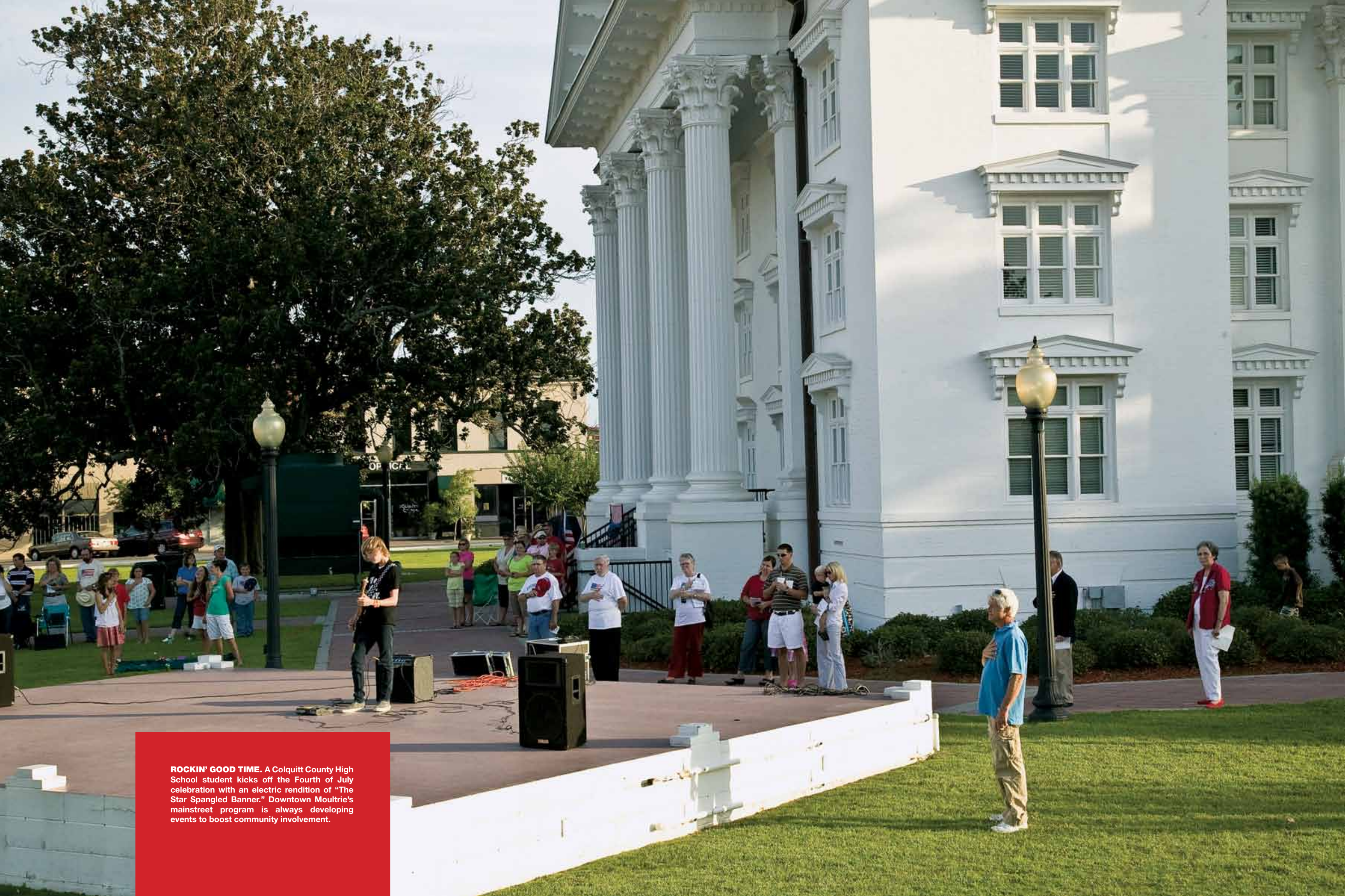
ROCKIN' GOOD TIME. A Colquitt County High School student kicks off the Fourth of July celebration with an electric rendition of "The Star Spangled Banner." Downtown Moultrie's mainstreet program is always developing events to boost community involvement.