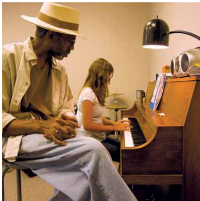
SOUNDS GOOD. A young musician gets expert help in playing the piano. The arts center has all kinds of musical instruction, from classical to rock.

The Colquitt County Arts Center, Moultrie's cultural destination, provides a curriculum for several disciplines to classes of all ages. The center also plays host to art exhibitions and events and contains one of the richest permanent collections in the region.