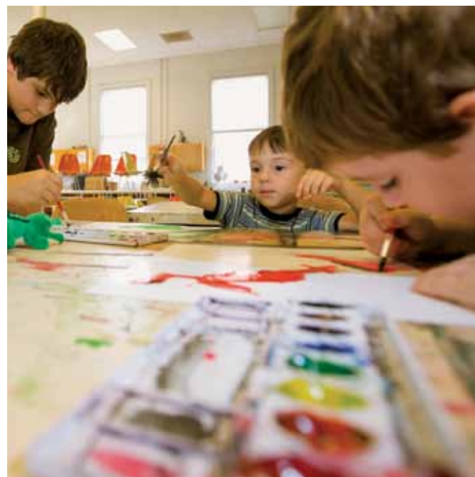
MASTERPIECE. Children paint with watercolors in the art center's studio. The converted historic schoolhouse makes a perfect setting for a visual arts course for all ages and skill levels.