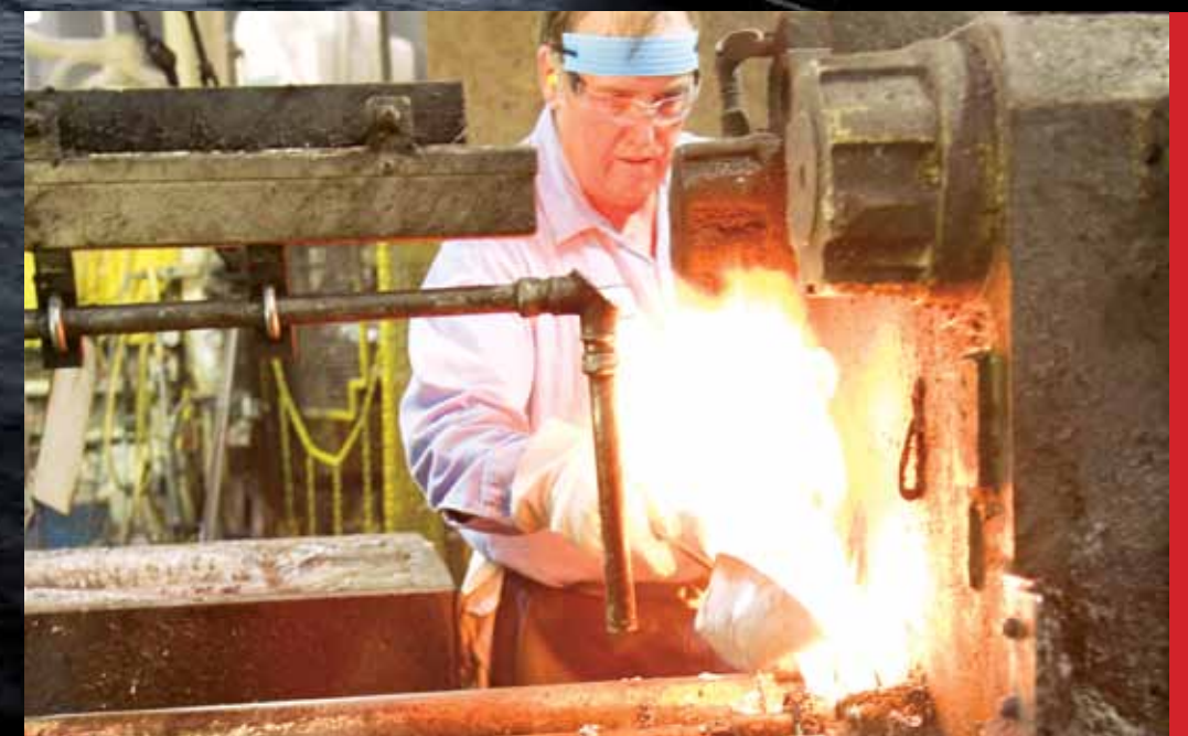
TESTED METAL. Steel is cast to make fittings for a light fixture in a local factory. In addition to metal manufacturing and fabrication, Moultrie hosts companies that manufacture products ranging from textiles to commercial ice machines.

Our business-friendly attitude means we help businesses get the land, agreements, labor and resources they need to be successful.