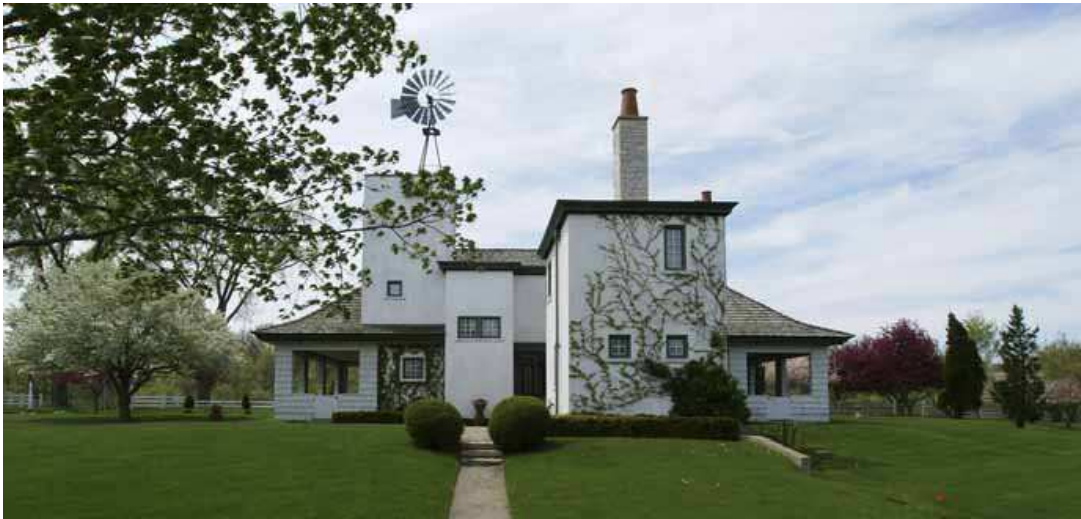
Rear Façade of Ellis House, Crab Tree Farm, Lake Bluff, IL