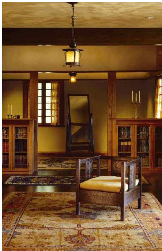
Interior of the Ellis House, Crab Tree Farm